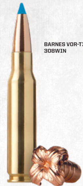
BARNES VOR-TX ® RR 308WIN

These reduced recoil loads feature lighter bullets with modest muzzle velocities, and modern propellants which work together to provide less felt recoil when a full payload round is not desired or necessary. In reduced recoil, as in all loads, Barnes copper, non-toxic X-bullets expand into four cutting petals that tear through tissue and give ideal terminal performance for good, clean kills.