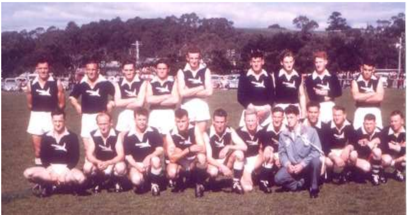
1961 Stanley Football Team (Premiers)