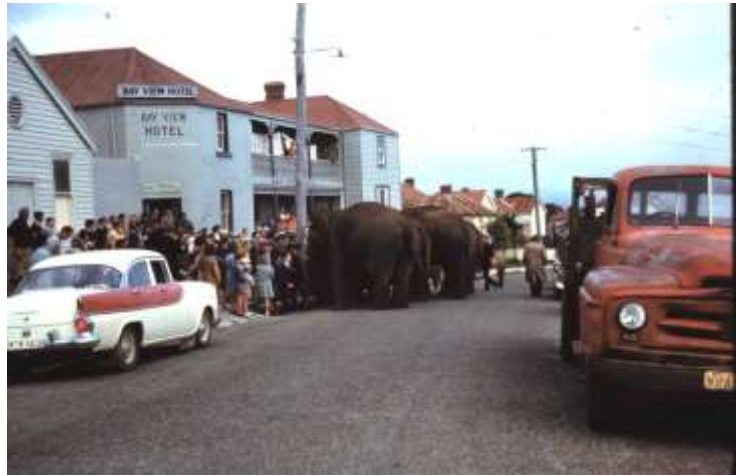
Elephants Outside Bayview Hotel (Now Ship Inn)