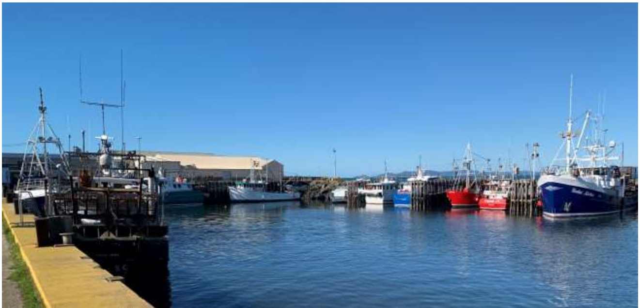
Scallop season is in full swing with boats arriving and being unloaded in readiness for splitting.