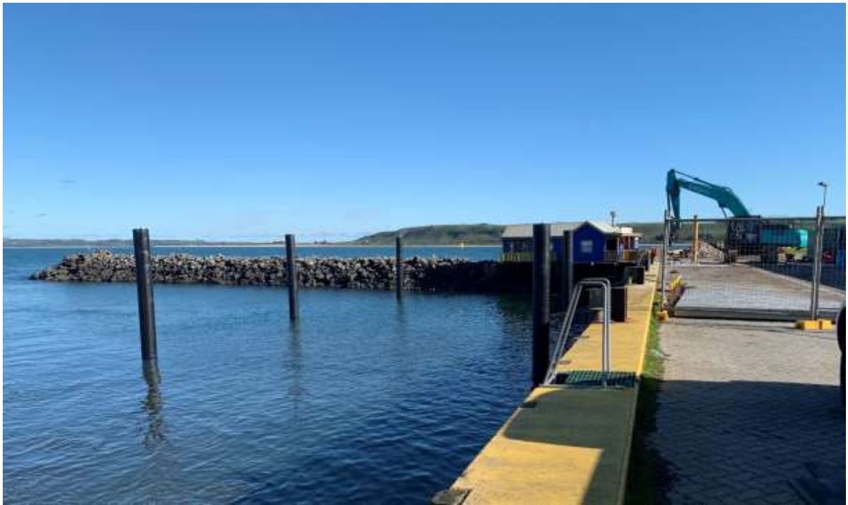
Above: Pylons are being driven in readiness for a floating pontoon that should be finished by the end of the year. Work is being undertaken by TasPorts.