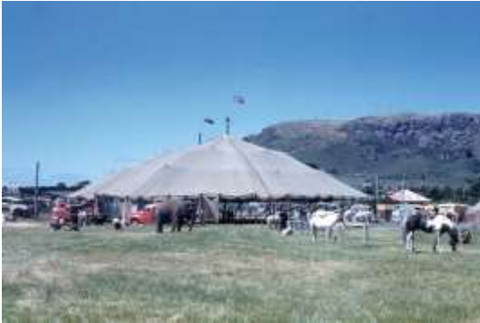
Tent on Rec Ground