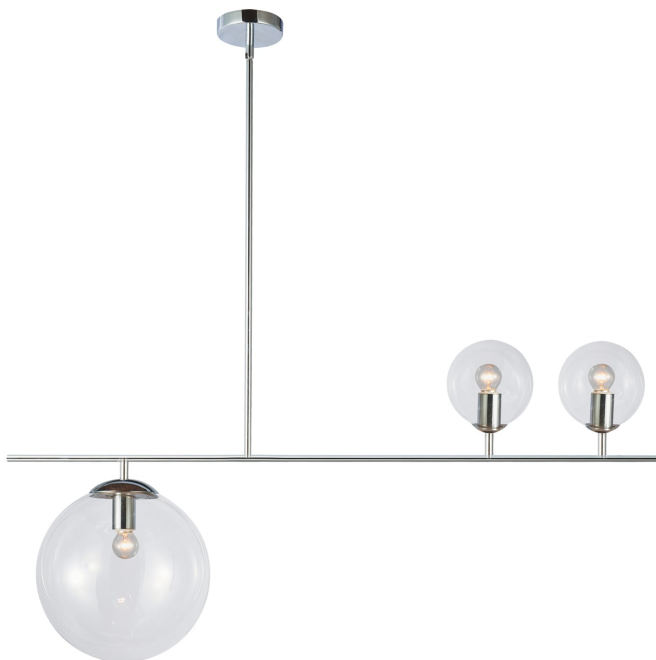
3 Light Incandescent Pendant, Polished Chrome Finish

Height 14.5 Width/Length 36 Depth 12 Weight 16