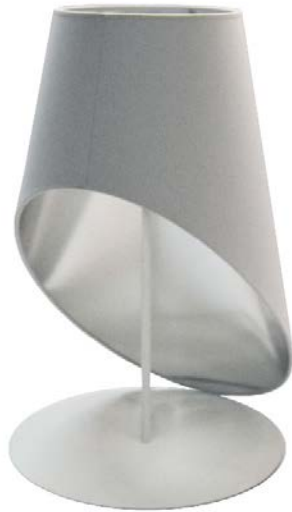
1 Light Slanted Tapered Drum Table, Wht/Slv Shade

Height 24 Width/Length 16 Depth 16 Weight 7