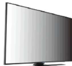
HDR display: 0.001 to more than 1,000 cd/m 2

Conventional display: 0.01 to 500 cd/m 2 HDR display: 0.001 to more than 1,000 cd/m 2