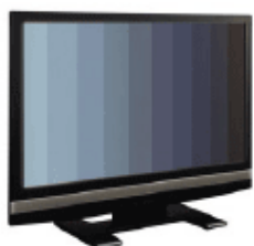
Earlier model display: 0.01 to 500 cd/m 2 Example: Measurement of display luminance

Recently, demands for higher-quality images and video have been growing among smartphone users, due partly to dramatic increases in communication speed. In response, manufacturers are accelerating the development of higher-resolution displays with improved contrast ratio and color reproduction, such as HDR displays. As a result, manufacturers of such displays require a color analyzer with a wider measurement range, from extremely low to high luminance.