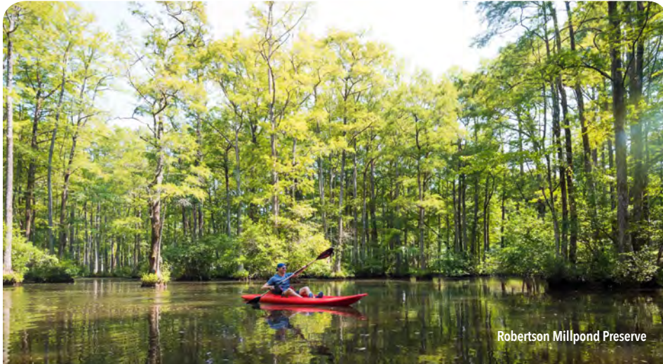
Robertson Millpond Preserve

Greater Raleigh Convention and Visitors Bureau 421 Fayetteville St., Ste. 1505 Raleigh, N.C. 27601-2995 919.834.5900 • 800.849.8499 919.831.2887 FAX www.visitRaleigh.com