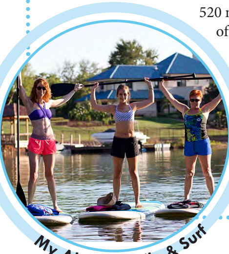
My Aloha Paddle & Surf

520 miles of shoreline, 3 power plants, and 32,510 acres of recreation make for plenty of opportunities to explore the waters of Lake Norman. Lake activities can mean a variety of things from wakeboarding , rowing , to fishing and sailing . It's a water sports paradise. With so many acres and miles of shoreline, the best way to explore the lake is by boat. Several marinas grace the shores of Lake Norman, providing boat rentals and launches. Boats and pontoons share the waters with kayaks , canoes , paddle boards , the occasional paddle boat and of course, swimmers . Paddle board at My Aloha Paddle Paddle & Surf or catch a ride on the area's first and only pedal-powered party boat at Charlotte Cycleboats . Also, stop by the public swimming beach for a quick dip at Ramsey Creek Park.