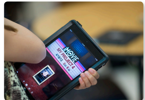
Student edits a project with her Apple iPad, protected by an OtterBox Defender Series.