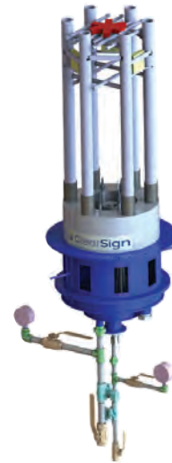
Duplex Plug & Play

Based on our successful retrofit of the Duplex Technology, we were awarded an additional contract for five other enclosed ground flares at this location. Our demonstrated ability to dramatically reduce emissions from enclosed ground flares has led to meaningful dialogue with regulators who are looking at ground flares as a potential source of emissions reduction. While the majority of enclosed ground flares are not currently regulated, our ability to dramatically reduce emissions from enclosed ground flares could create a new category killer for us within this emerging potential market. Greater regulations of existing enclosed ground flares could lead to a potential billion dollar market for ClearSign over the next five to ten years.