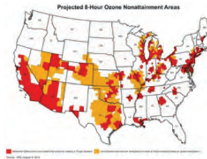
Projected non-attainment areas under the 2015 limit of 70 ppb