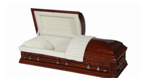
Northern NL06 Hilton