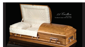
Northern 33 Carlton Rental