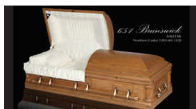
Northern 51 Brunswick