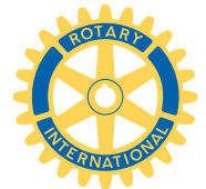
Trenton & Campbellford