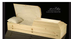
Northern 101 Eden