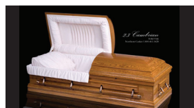
Northern 23 Cambrian