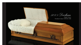
Northern 504D Durham