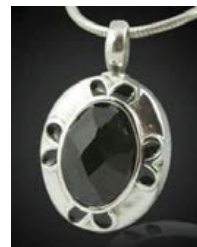
Gravurecraft J-1100 Circular Pendant

See Funeral Director for specific pricing