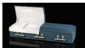
Northern 60 Cloth