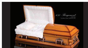
Northern 650 Rougemont