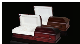
Northern 526W Norway