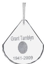
Diamond Edge Teardrop Ornament