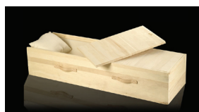
Northern Eden 102