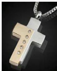
Gravurecraft J-100 Gold/Silver Cross