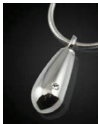
Gravurecraft J-1020 Drop