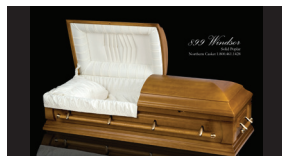
Northern 899 Windsor