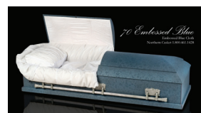
Northern 70 Embossed