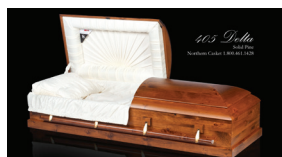
Northern 405 Delta Pine