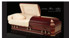
Northern 500 Rose Arbor