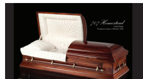
Northern 707 Homestead