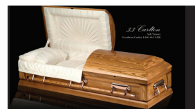
Northern 33 Carlton