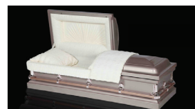
Northern N201 Franklin Orchid

We have many casket manufacturers and suppliers that offer a myriad of casket options and selections. Please ask your funeral planner for further details and pricing.