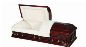
Northern NL01 Westminster