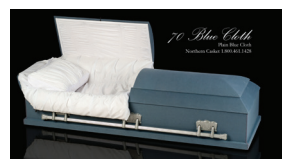
Northern 70 Grey