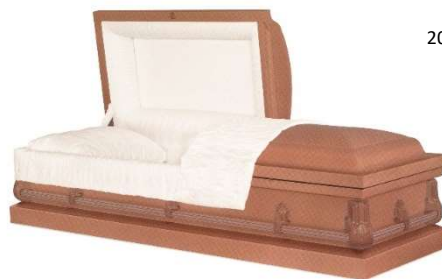
20 ga. Non-gasketed casket