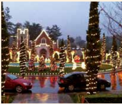
We bring the North Pole to you with our popular holiday light exhibition.