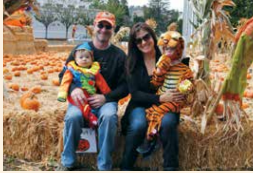
Mountain View Cemetery's annual pumpkin festival is one of our most popular events—come see why over 1,000 people attend every year!

Celebrate Halloween at our fun-filled pumpkin patch meadow, with free pumpkins, fun activities, and treats for the kids. Our long-standing Halloween tradition continues this year and immediately follows the Piedmont Avenue Merchants Association's annual Halloween parade, which is a daylong celebration that includes trick-or-treating at participating stores on the avenue. To join in the fun, head down to the end of Piedmont Avenue after the parade and proceed into the cemetery to the pumpkin patch meadow. Children can choose a free pumpkin (one per child and quantities are limited) and enjoy lots of other activities, including: five bouncy fun-houses to jump around in, hay-bale tunnel, balloon artist, face painting, animal show, and a craft area to decorate pumpkins, masks, and treat bags. Food truck vendors will be available on site for your family eats. Live music from "Shades of Gray" will be here to entertain everyone. Put on your dancing shoes and enjoy the afternoon at the cemetery. Parents must accompany their children to this event 🍂