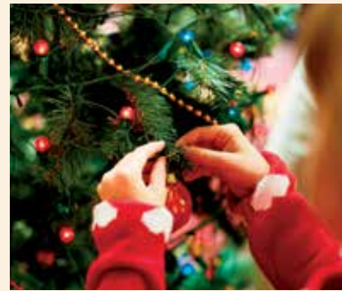
Choose an ornament to hang on our remembrance tree to honor family and friends who are no longer with us. If you're unable to attend, we're happy to hang an ornament on your behalf.

Enjoy holiday refreshments, listen to festive holiday music, and warm yourself by our crackling fire as you reflect on treasured memories during this special time of year. 🍂