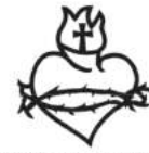
(62) SACRED HEART