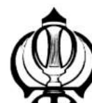
(36) SIKH (KHANDA)