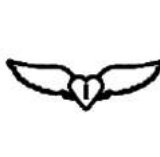
(21) SUFISM REORIENTED