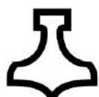
(55) HAMMER OF THOR