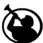
(11) MORMON (ANGEL MORONI)