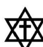
(44) MESSIANIC JEWISH