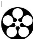
(22) TENRIKYO CHURCH