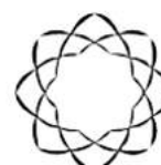
(35) SOKA GAKKAI INTERNATIONAL (USA)