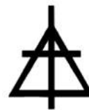
(26) CHRISTIAN REFORMED CHURCH