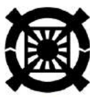
(56) UNIFICATION CHURCH