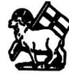
(27) UNITED MORAVIAN CHURCH