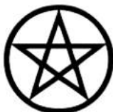
(37) WICCA (PENTACLE)