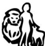
(20) COMMUNITY OF CHRIST