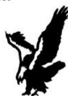
(52) LANDING EAGLE