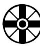
(24) THE CHURCH OF WORLD MESSIANITY