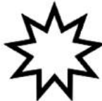
(15) BAHAI (9-POINTED STAR)