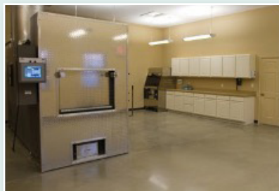
Our crematory, privately owned and operated