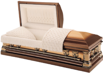
Aegean $7,800 copper, velvet interior