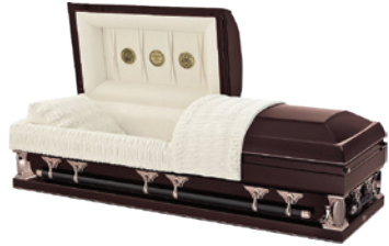
Merlot $4,950 (purchase)