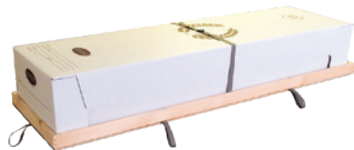
Minimum Alternative Container $295