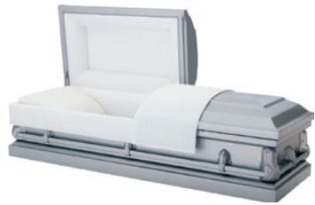
Apollo (Silver)* $1,895 20 gauge steel, crepe interior

Caskets manufactured by Batesville, Connecticut Casket Company and Matthews Aurora™ Funeral Solutions.