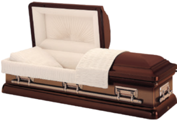
Auburn Sunset $4,500 18 gauge steel, velvet interior