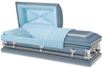
Aries (Blue)* $2,750 20 gauge steel, crepe interior