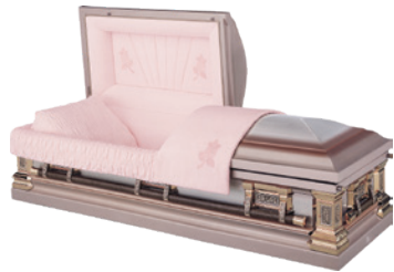
Tapestry Rose $5,750 stainless steel, velvet interior