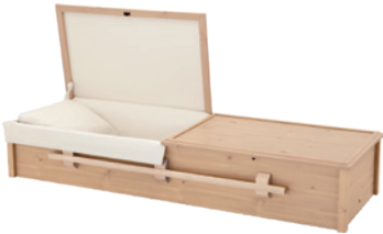
Shaker Pine $900