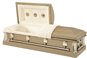
S01 Sand $3,750 20 gauge steel, crepe interior