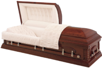
Pearson $7,500 (purchase)

Rental caskets include minimum alternative container