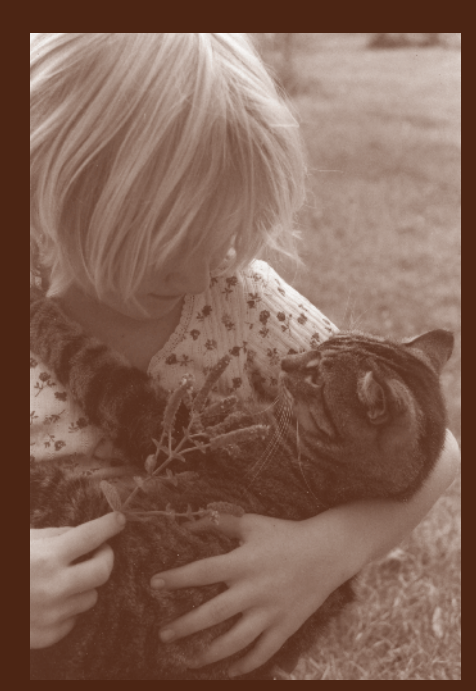
"When I play with my cat, how do I know that she is not passing time with me rather than I with her?"

At Butler Funeral Homes & Cremation Tribute Center we offer information that will help you and your family with grieving the loss of your pet. Pet caskets, urns and transferable residential yard markers are also available all at reasonable costs. Our staff can answer all your questions and show you our complete selection of pet memorial merchandise. For more information or for a tour of our facility, please call us at (217) 544-4646.