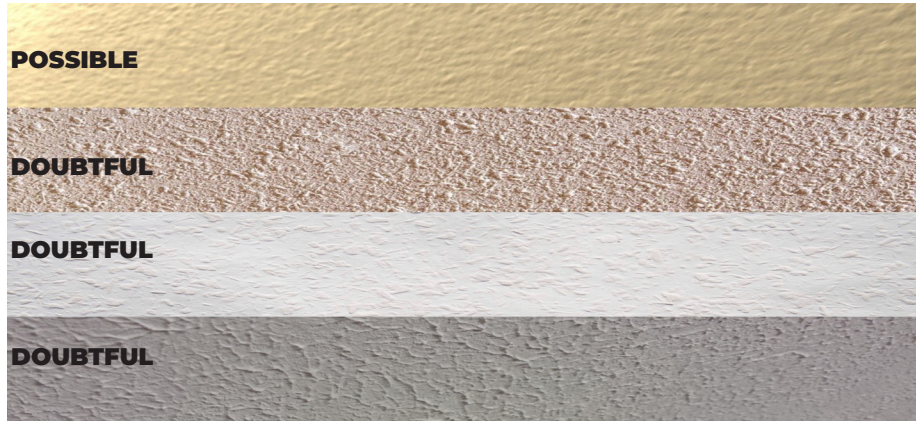
PHOTO TEX SELF-ADHESIVE CAN ADHERE TO VIRTUALLY ALL PAINTS (EXCEPT THE PRO-MAR 400 ZERO VOC PAINT). WE STRONGLY SUGGEST READING THE WALL PREP BULLETIN WHEN THE WALLS ARE PAINTED WITH THE LOW, NO OR ZERO VOC PAINTS. KEEP IN MIND, CERTAIN HEAVIER TEXTURED WALLS CAN CAUSE STICKING ISSUES, SO PLEASE TEST FIRST. WE NOW OFFER A NON-OPAQUE HIGH TACK (EX OR EXS) FOR AREAS YOU FEEL MAY REQUIRE A MORE PERMANENT TACK.

IT IS VERY IMPORTANT THAT YOU ALLOW A NEWLY PAINTED WALL 30 DAYS TO COMPLETELY OUT-GAS. THE GAS CAN TRAP BEHIND THE MATERIAL AND IT WILL CAUSE BUBBLING. YOU CAN FIRST TRY TO RUB THE BUBBLE OUT. OTHERWISE, PEEL BACK THE MATERIAL AND LET THE GAS ESCAPE AND RE-APPLY.