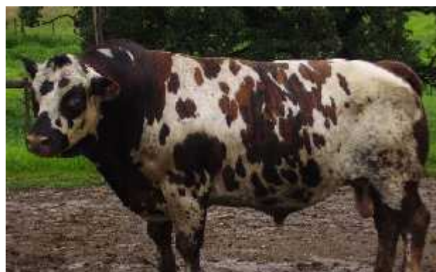
CIRCLE D ROCKET IMPACT 622P. FORMER HERD SIRE AT PDM NORMANDES. FROZEN SEMEN IS AVAILABLE.