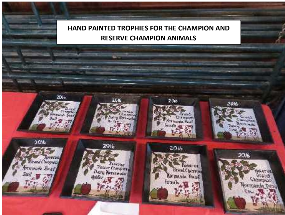
HAND PAINTED TROPHIES FOR THE CHAMPION AND RESERVE CHAMPION ANIMALS

It was a beautiful and warm fall day for the 2016 National Normande Show on October 1, 2016. Eleven breeders from Missouri, Iowa, Nebraska and Wisconsin entered 60 Normandes and brought them to Mineral Point, WI for the show. 28 of those Normandes were exhibited in the dairy show and 32 animals were exhibited in the beef show.