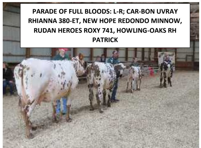
PARADE OF FULL BLOODS: L-R; CAR-BON UVRAY RHIANNA 380-ET, NEW HOPE REDONDO MINNOW, RUDAN HEROES ROXY 741, HOWLING-OAKS RH PATRICK

There were four entries in the Pen of 3 Heifers class. Placing first was the entry from Dewey Brothers. Crick Ridge Farm stood in second place with their three heifers. And Double M Cattle Company LLC had the third place group of females.