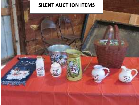
SILENT AUCTION ITEMS