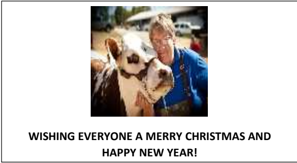
WISHING EVERYONE A MERRY CHRISTMAS AND HAPPY NEW YEAR!