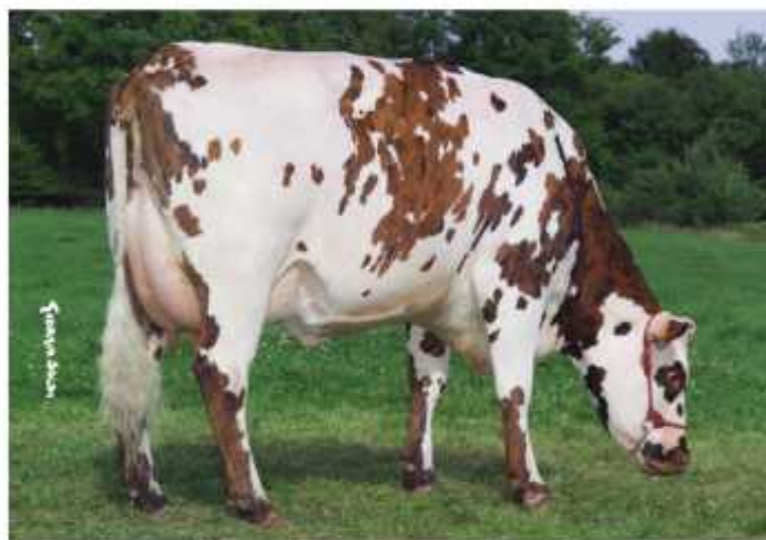
Valence, daughter of Redondo, a unique bull for production and type

Proven French bulls are bulls tested in France on the Normande population. Their daughters are evaluated and compared to other heifers of the same generation. As a result, predictive values for the future daughters are calculated, and will allow you to pick and choose the traits you desire: milk production, components, size, feet & legs, calving ease, and more. Individual sheets for each bull are available on our website. Feel free to contact us for more information.