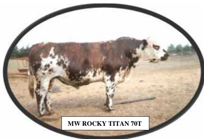
MW ROCKY TITAN 70T

Double M Cattle Company LLC believes performance data is critical for the progress and success of any breed or farm enterprise. Since 1992 we have been gathering birth weights and weaning weights on our calves. In late 2012, Double M Cattle Company LLC began collecting carcass data to measure the progress of our breeding program and to confirm Normande genetics produces a quality carcass that meets the beef industry's standards. The resulting carcass data has been gratifying and is verifying our breeding program is moving in the right direction.