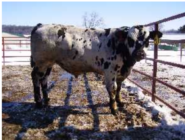
CIRCLE D ARMOR 206A

The bull entered from the Circle D Farm is Circle D Armor 206A. A son of Crick Ridge Winky 28X, he was born on 04-23- and had a birth weight of 94 pounds. His weaning weight was 460 pounds and he began the test weighing 550 pounds.