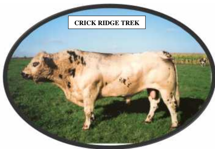
CRICK RIDGE TREK