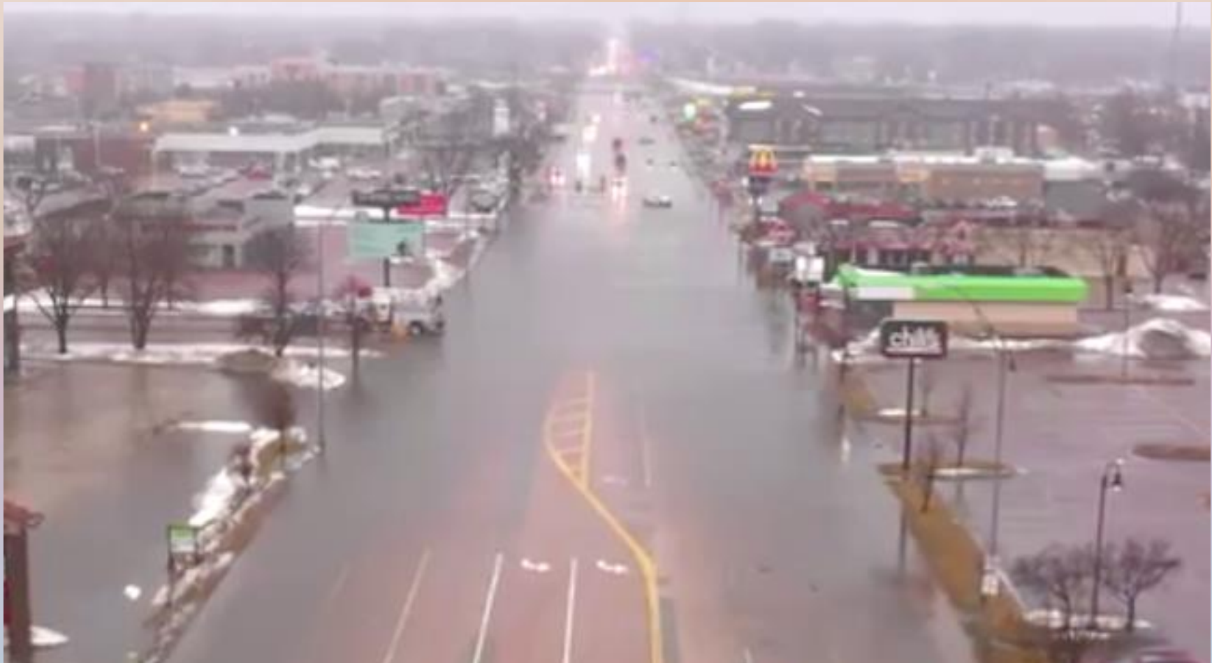
Image Argus Leader 3/14/2019. 41 st & Louise High river & iced sewers slowed storm drainage