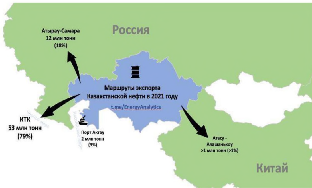
Kazakhstan oil export routes in 2021

Kazakhstan's adjusted crude oil production forecast for 2022 is 84 million tonnes . 23 Refining volume is predicted to be 18 million tonnes . 24 The oil production forecast for 2023 is 90.3 million tonnes . 25