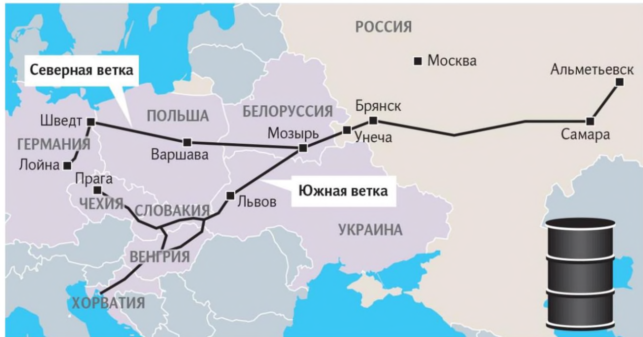
The route map of the Druzhba oil pipeline 42

Using Kazakhstan as an alternative source of oil and oil products in the European Union above Kazakhstan's existing annual supply volumes would undermine the political objective of the West to deprive Russia of the means to wage military aggression against Ukraine.