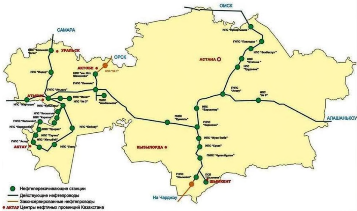
The map of Kazakhstan main pipelines 34

pipeline. As of 30 December 2022, Russia is able to sell 20 million tonnes of oil to China through the Atasu-Alashankou pipeline with the help of Kazakhstan without any problems.