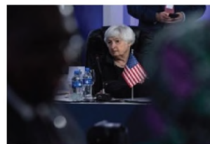
Russian assets no substitute for U.S. aid to Ukraine – U.S. Treasury