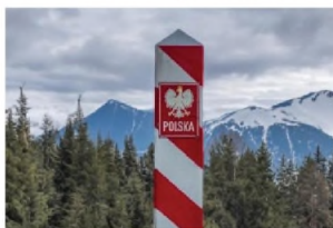
Polish farmers put Shehyni border checkpoint on Ukraine border on full shutdown for cargoes