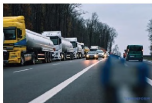
War risk insurance: Unity program extended to non-military cargoes