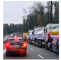
Slovakia starts letting trucks through - 100 trucks