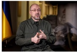
EBRD to provide €150M to Ukraine to support energy security - Shmyhal