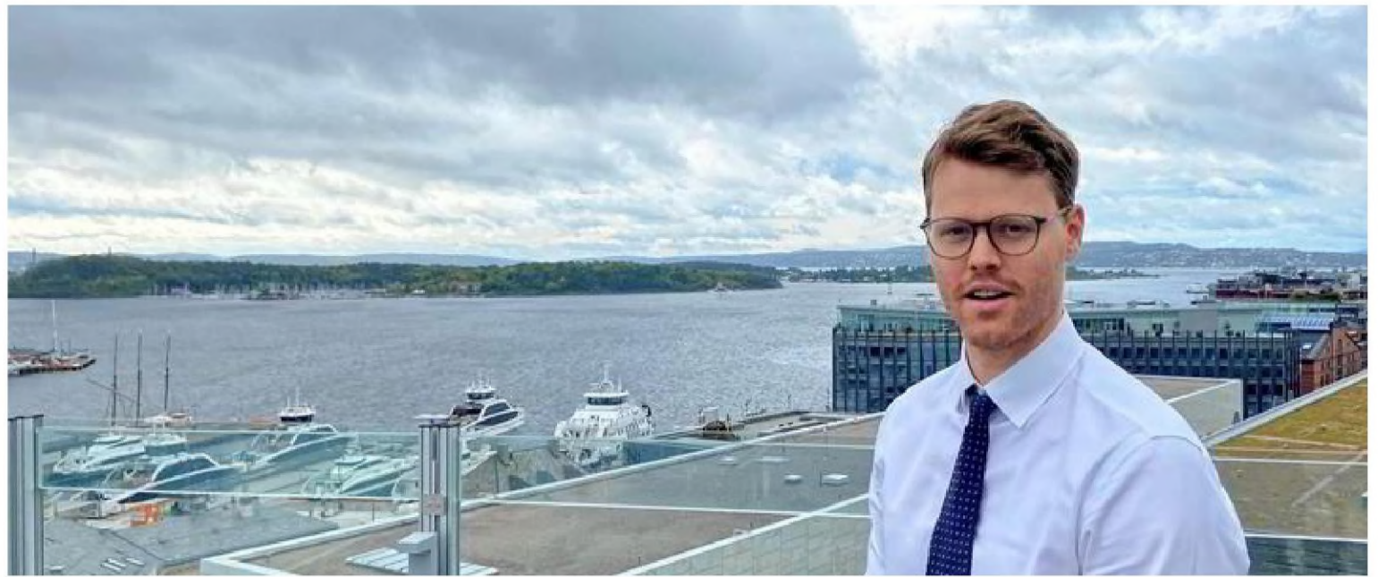
Big name Norwegian investors to play key role in drilling M&A, Pareto Securities says