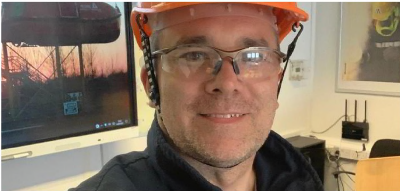
Drilling success opens door to further development of UK offshore gas asset