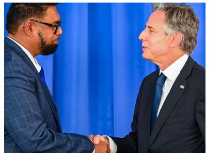
Guyana wary of Venezuelan intent as border dispute escalates