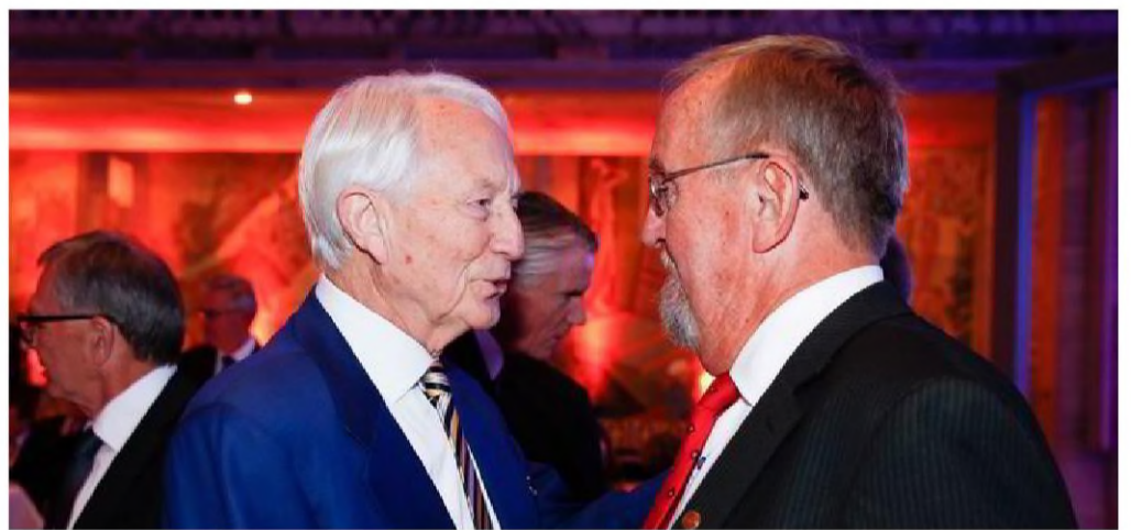
Tributes flow in for 'visionary' architect of Norway's petroleum industry