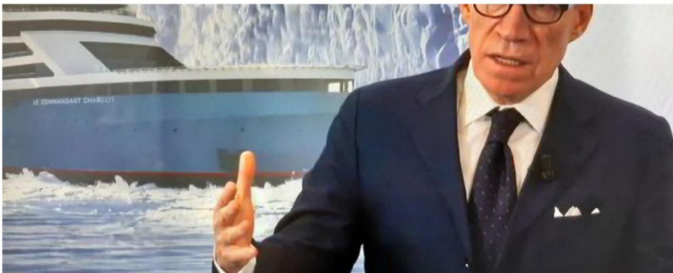
European LNG heavyweight ties up with Chinese yards to optimise FLNG engineering