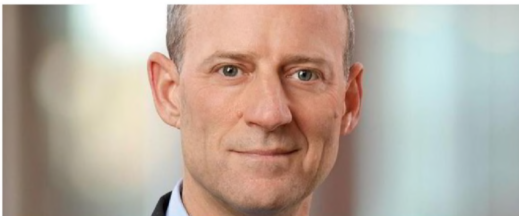
Oil flowing again at Asian offshore field where expansion FID anticipated in 2024