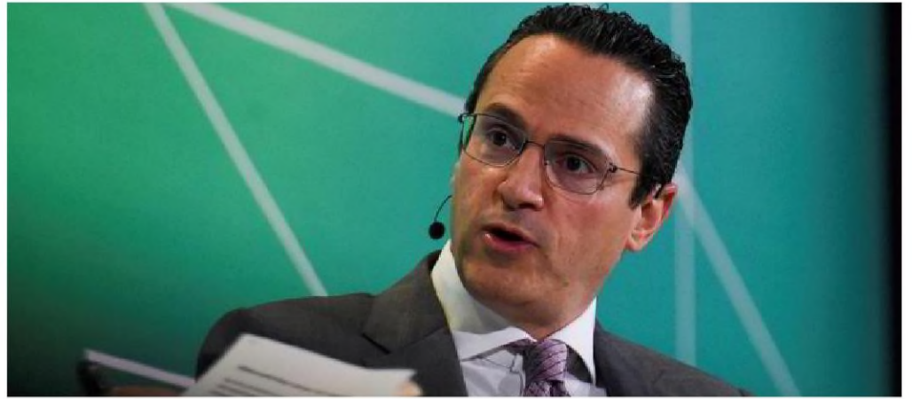
Shell targets one more shot at glory with 'lucky charm' rig in Namibia's white-hot Orange basin