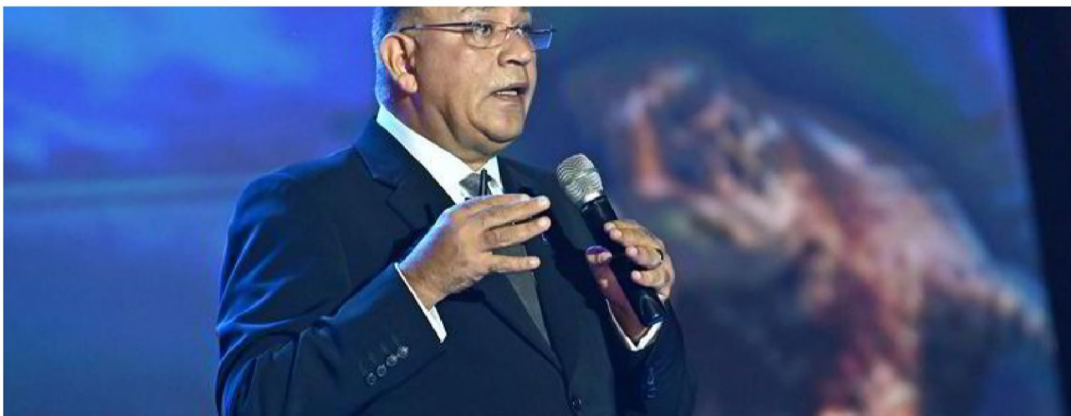
Asian heavyweight aiming for bumper production boost by 2028