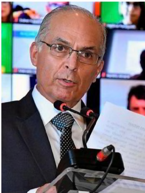
Brazil adds blocks with billion-barrel potential to bid round initiative