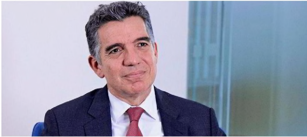
How Petrofac aims to address its cash crunch and restore investor and banker confidence