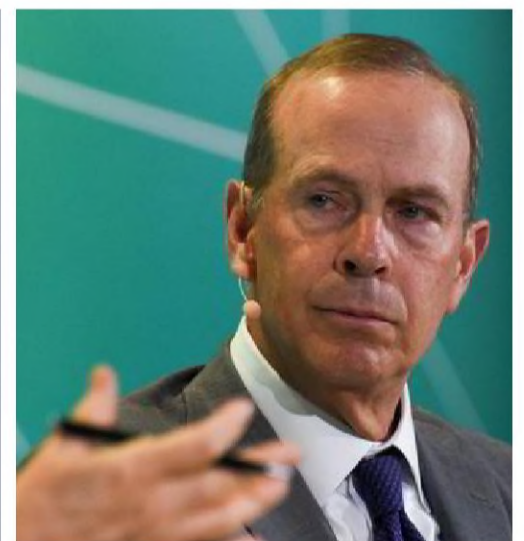
Chevron joins Namibian hydrocarbon hunt with epic drilling campaign