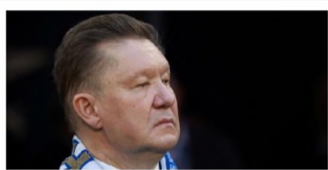
Gazprom threatens to halt Russian gas exports to Europe via Ukraine

Just four months later, in October 2020, Ukraine's parliament rubber-stamped Chernyshov's appointment to the post of development minister for territories and communities.