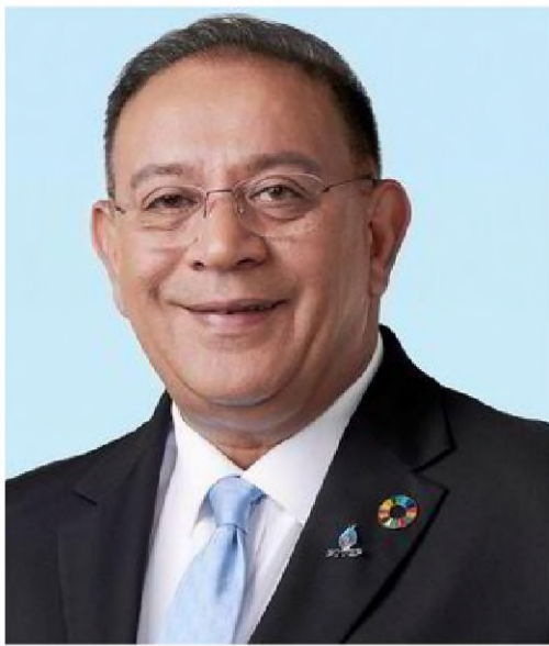
PTTEP and Petronas pushing ahead with ageing FPSO replacement