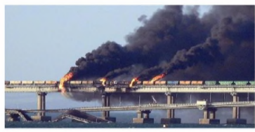
Crimea producer sees Black Sea gas production wiped out after Russian invasion

With degrees in business and law from educational establishments in Kharkiv, Chernyshov was one of many successful, self-propelled Ukrainian businessmen who navigated the murky rules of the country's economy, which was engulfed in widespread corruption and nepotism after Ukraine declared independence in 1991.