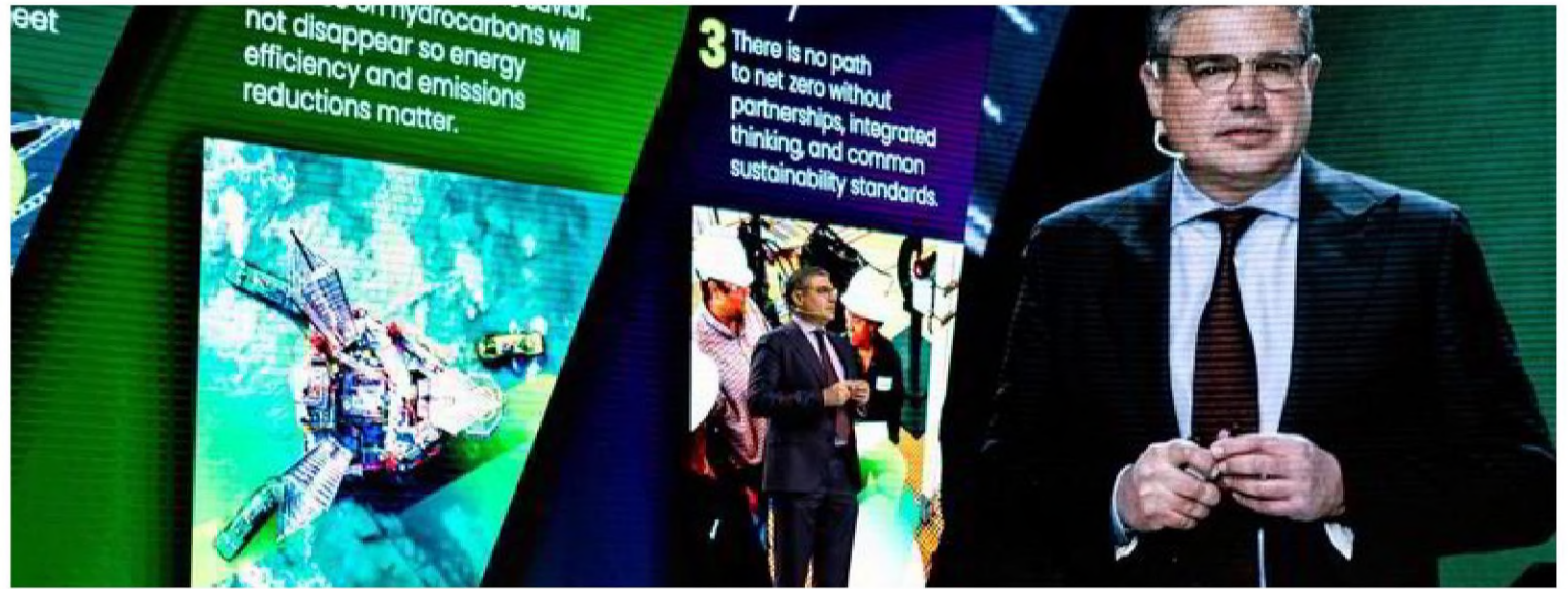
Baker Hughes wins key West Africa contract