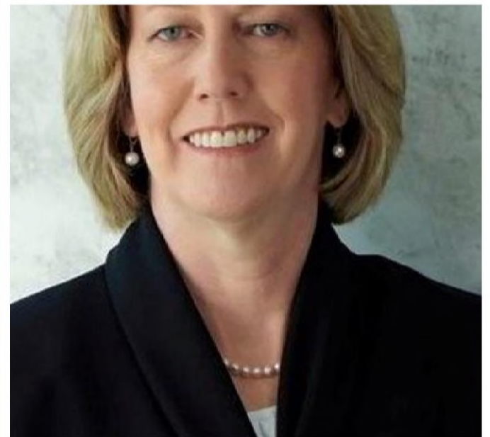
Woodside reaches agreement with unions on LNG vessel crew