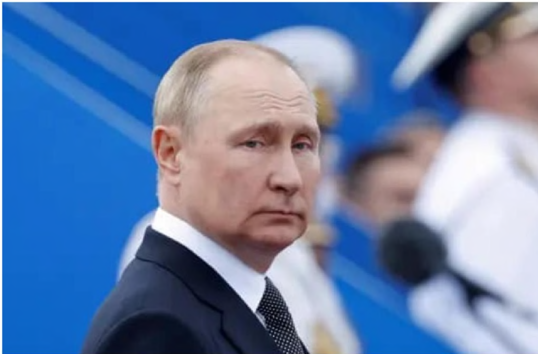
"Vladimir Putin has a body double due to a terminal illness."