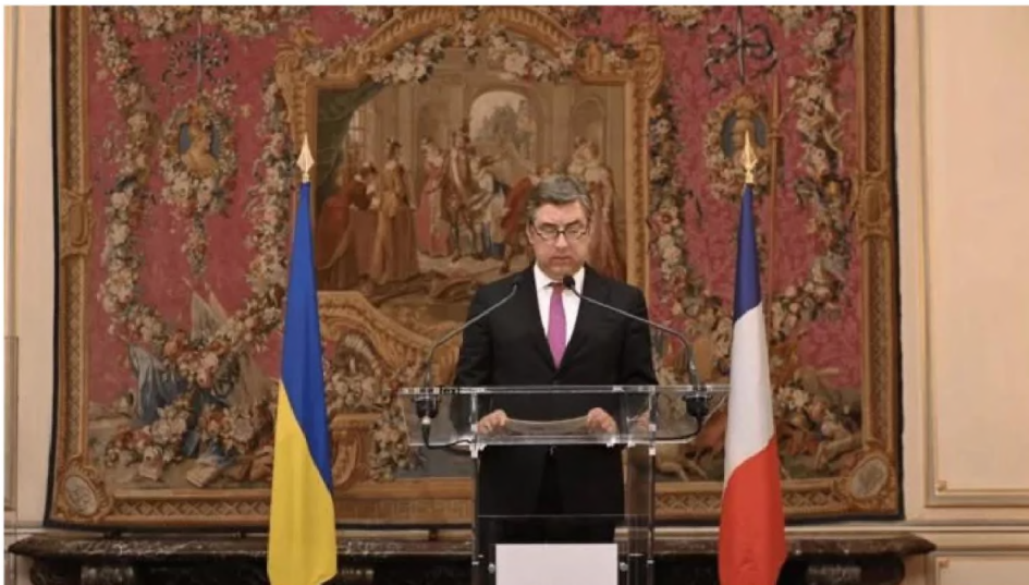
Ambassador of Ukraine to France, HE Vadym Omelchenko, an illustrative image

2023/04/22 - 20:29 • LATEST NEWS UKRAINE