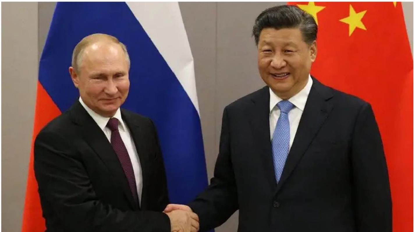
Russian President Vladimir Putin shakes hands with Chinese President Xi Jinping during a bilateral meeting on Nov. 13, 2019, in Brasilia, Brazil.

This invasion is an effort by Vladimir Putin to reshape Europe and recreate the Russian empire. We know this because it is what he's said. Putin has made it clear that he will not stop in Ukraine, but indeed that he will move forward in other areas of Europe to include Moldova, Georgia and eventually the Baltic states. If he succeeds in Ukraine, Putin will bide his time, rearm and reset, then begin to dismantle Europe like we haven't seen since WWII.