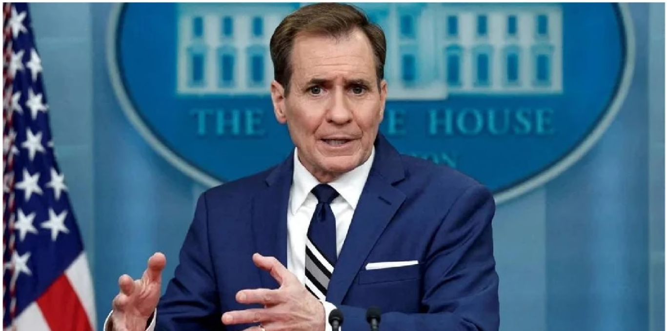
US hasn't 'seen any evidence that there's been any egregious misconduct'

The White House sees no signs of flagrant violations of Ukraine's use of military aid provided by the United States,