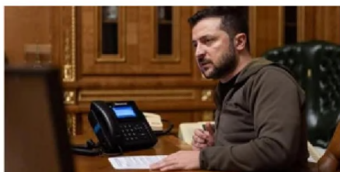
Zelenskyy expresses interest in dialogue with Xi Jinping, but China yet to extend invitation

Ukrainian President Volodymyr Zelenskyy welcomed Beijing taking an interest in Ukraine, but disagreed with some of the points in the document.