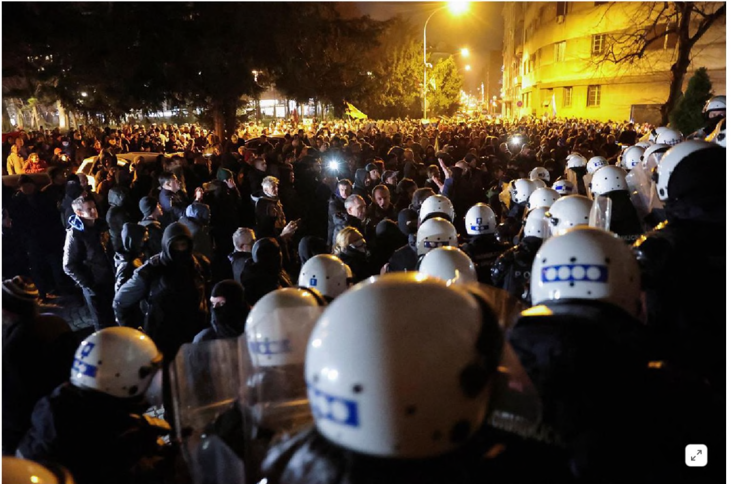
[1/5] Police block Serbian right-wing protesters who attempted to storm the New Palace, the seat of President of Serbia, during a protest against the Serbian authorities and French-German plan for the resolution of Kosovo in Belgrade, Serbia, February 15, 2023. Read more