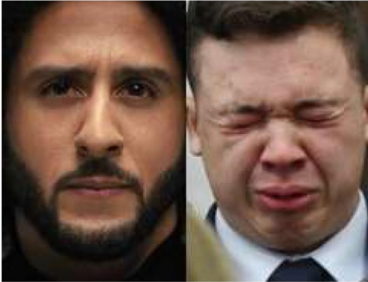
Kaepernick's Rittenhouse Comments Just Set The Internet On Fire