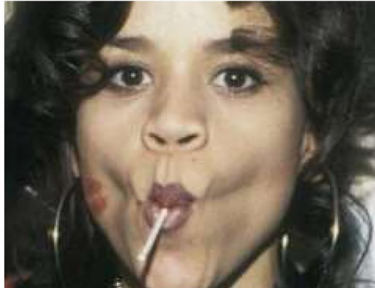
The Tragedy Of Rosie Perez Is Really Beyond Heartbreaking