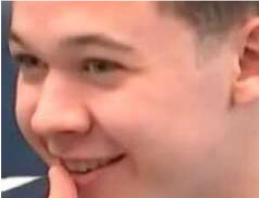
Rittenhouse's Reaction After Leaving Court Is Causing A Big Stir TMZ.com