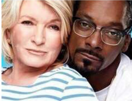
The Truth About Martha And Snoop Is Really No Secret Anymore