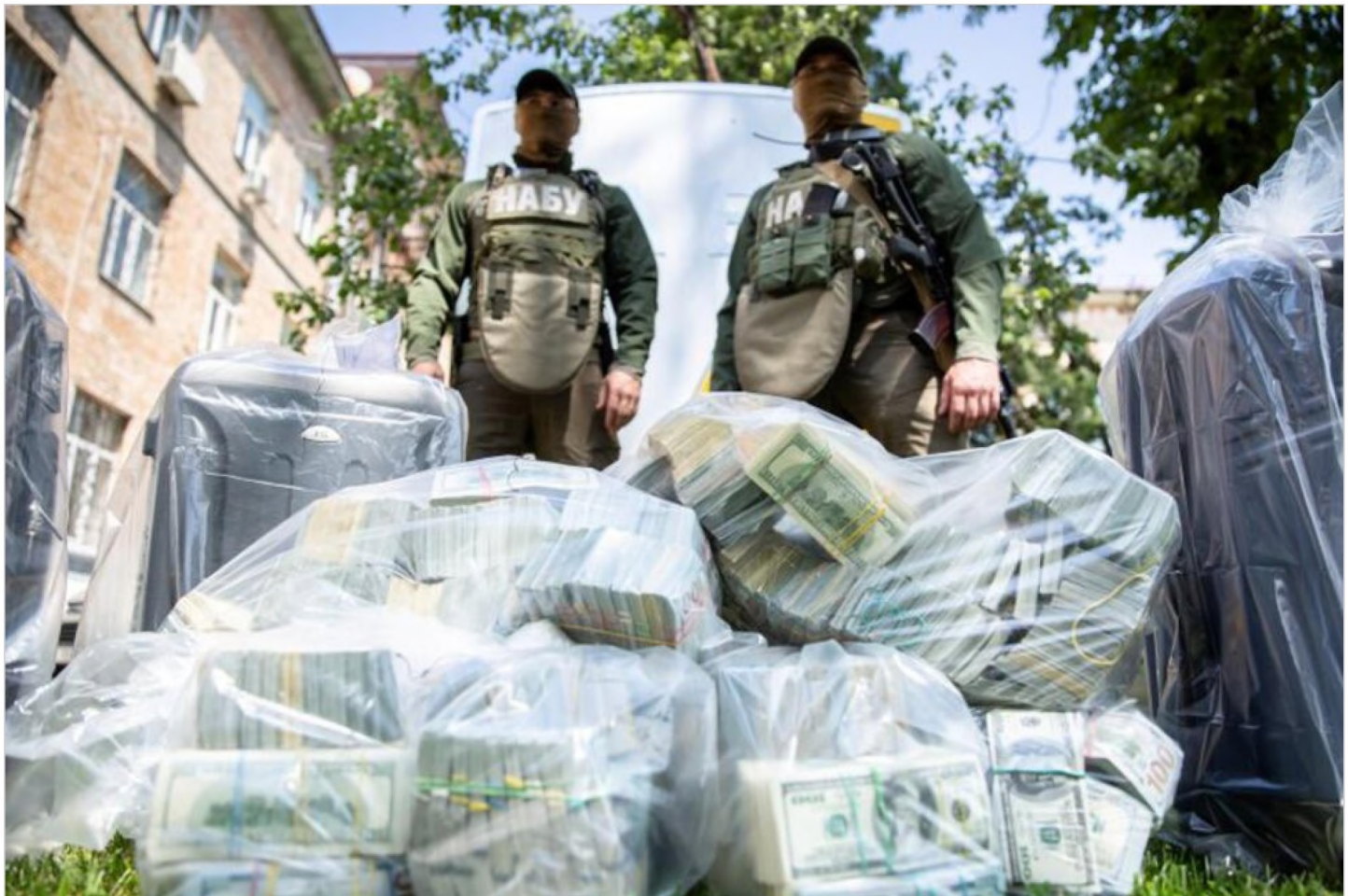
FILE PHOTO: Officers of the National Anti-Corruption Bureau of Ukraine stand next to plastic bags filled with seized U.S. Dollar banknotes in Kiev, Ukraine, in this handout picture released June 13, 2020. Press Service of the National Anti-Corruption Bureau of Ukraine/Handout via REUTERS