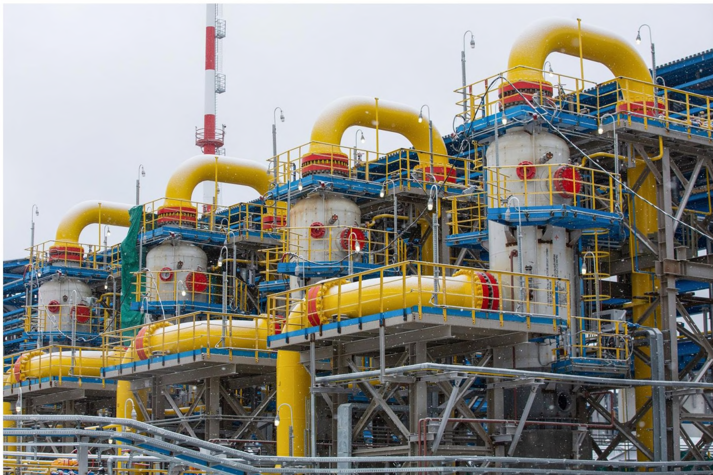
The Gazprom PJSC Slavyanskaya compressor station, the starting point of the Nord Stream 2 gas pipeline, in Ust-Luga, Russia.

Europe spent years trying to wean itself off Russian gas, but keeping warm this winter means the continent will need it as much as ever.