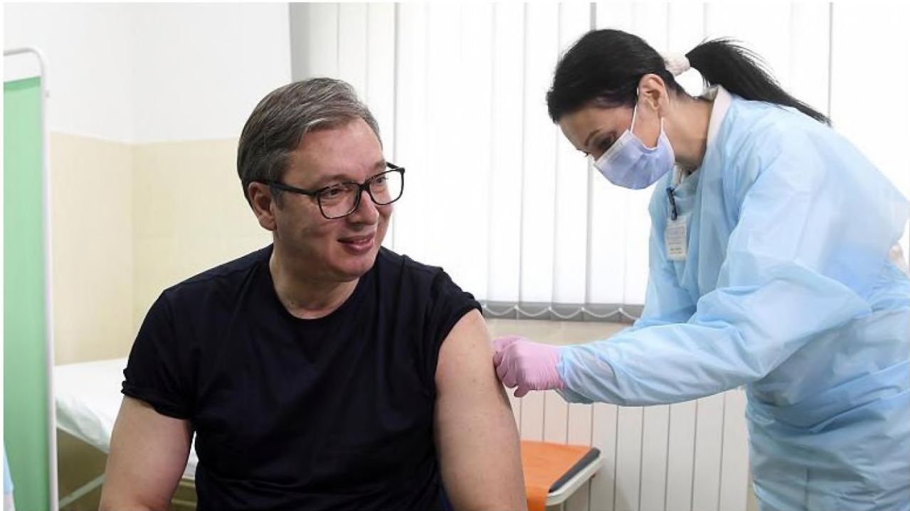
Serbian President Aleksandar Vucic received a dose of the Chinese Sinopharm vaccine on April 6.

By Euronews with agencies • Updated: 05/05/2021