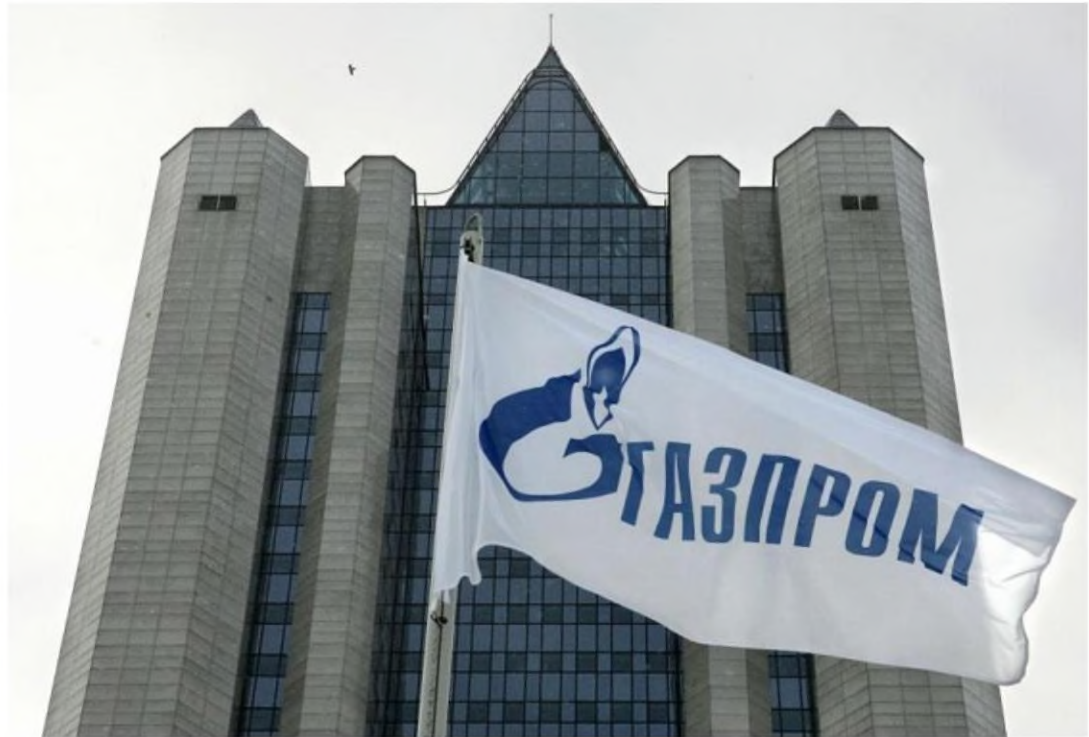
General view of Russian natural gas giant Gazprom's headquarters in Moscow.