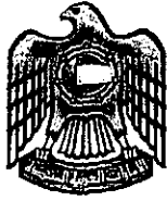
Permanent Mission of the United Arab Emirates to the United Nations