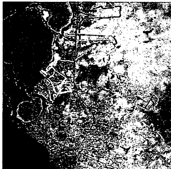
Before Ceasefire: Sand Barriers, Trenches. After Ceasefire: Trenches.

Houthis have defied UN timeline for withdrawal of militia units from Hodeida, Al Saleef and Ras Issa ports.