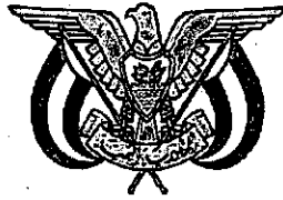
Permanent Mission of the Republic of Yemen to the United Nations