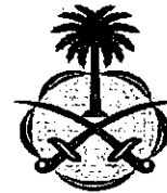
Permanent Mission of the Kingdom of Saudi Arabia to the United Nations