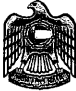
Permanent Mission of the United Arab Emirates to the United Nations