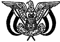
Permanent Mission of the Republic of Yemen to the United Nations