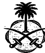
Permanent Mission of the Kingdom of Saudi Arabia to the United Nations

We are enclosing, for the Council's review, a detailed overview of all violations of the ceasefire agreement that entered into force four weeks ago, on 18 December 2018. This report evidences continual attacks on forces of the Coalition to Support Legitimacy in Yemen, in areas covered by the ceasefire agreement. Since the arrival of the first UN monitors in Hodeidah, the rate of around 20 violations per day has remained constant, but the focus has shifted slightly away from the center of the city, and towards southern parts such as Al Tuhaita, Al Jubaila, and Hays – all within the scope of the ceasefire agreement. In terms of absolute numbers, there have now been a total of 573 recorded violations, leading to the death of 41 Coalition forces and the wounding of another 396. The Coalition hopes that the deployment of an increased number of UN monitors will help to ensure greater compliance by the Houthis.