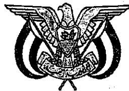
Permanent Mission of the Republic of Yemen to the United Nations