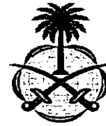
Permanent Mission of the Kingdom of Saudi Arabia to the United Nations

For the past two weeks, a convoy intended for Sana'a – with enough food to feed 3.7 million people for one month – has been held up in Hodeidah by the Houthis, who refuse to reciprocate cross-line arrangements. The ceasefire was meant to create a space for a significant increase in humanitarian aid deliveries, and yet the Houthis are attempting to hold hostage those in need, and to turn their suffering into a political bargaining chip.