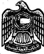
Permanent Mission of the United Arab Emirates to the United Nations