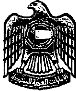
Permanent Mission of the United Arab Emirates to the United Nations