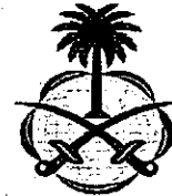
Permanent Mission of the Kingdom of Saudi Arabia to the United Nations

We call upon the Security Council to join other members of the international community in condemning the Houthis' deliberate attempts to undermine the Stockholm Agreement and to derail the political process. It is important to send a clear message to them - and to their Iranian backers - that they will be held responsible for their actions.