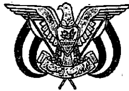
Permanent Mission of the Republic of Yemen to the United Nations