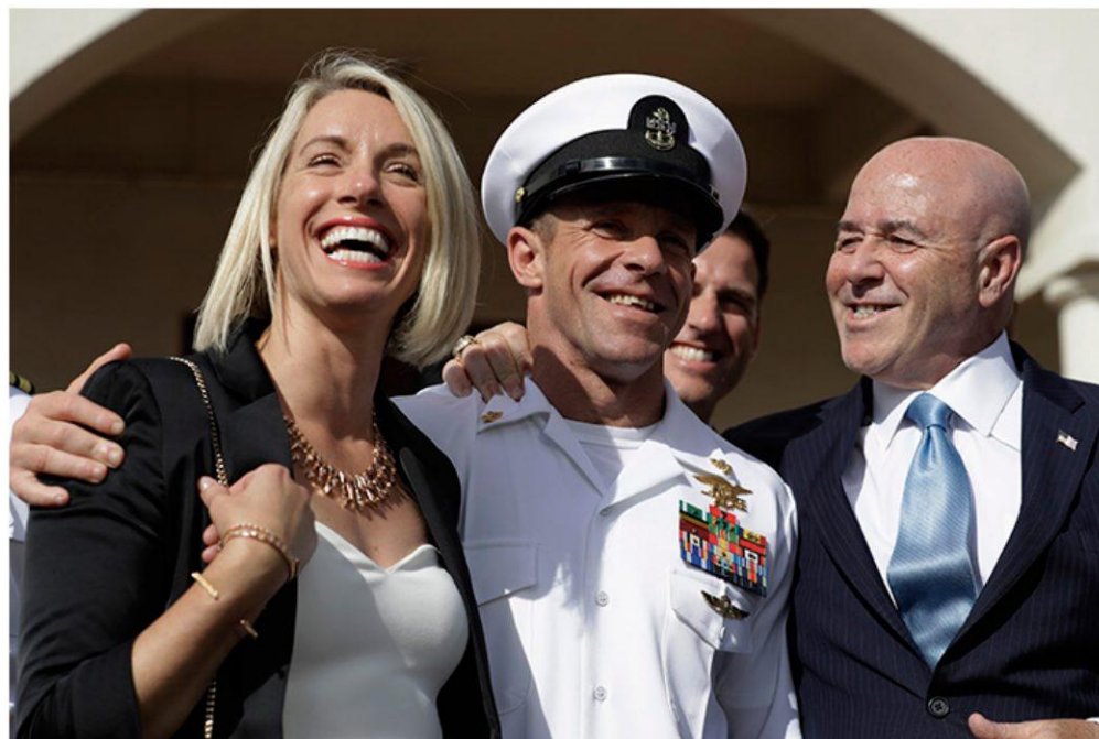
PHOTO DU JOUR: Navy Special Operations Chief Edward Gallagher leaves court in San Diego on Tuesday after being acquitted of murder in a war crimes case that drew President Donald Trump's attention.