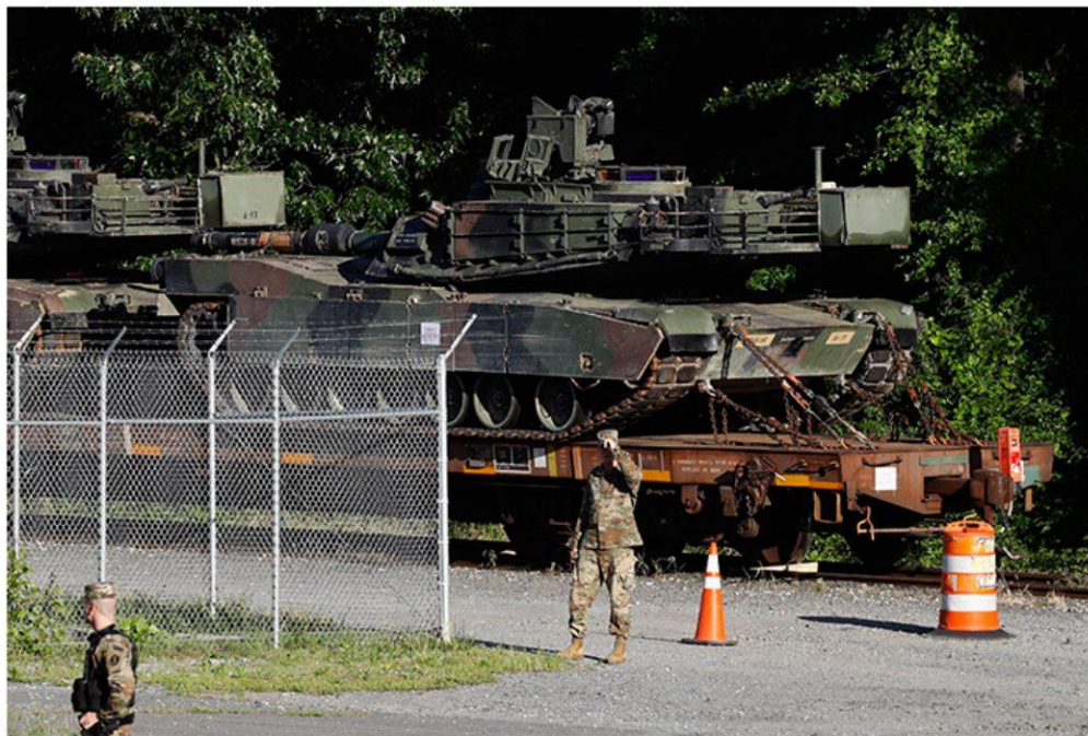
PHOTO DU JOUR: Military police walk by Abrams tanks in Washington on Monday ahead of President Donald Trump's upcoming July Fourth celebration.