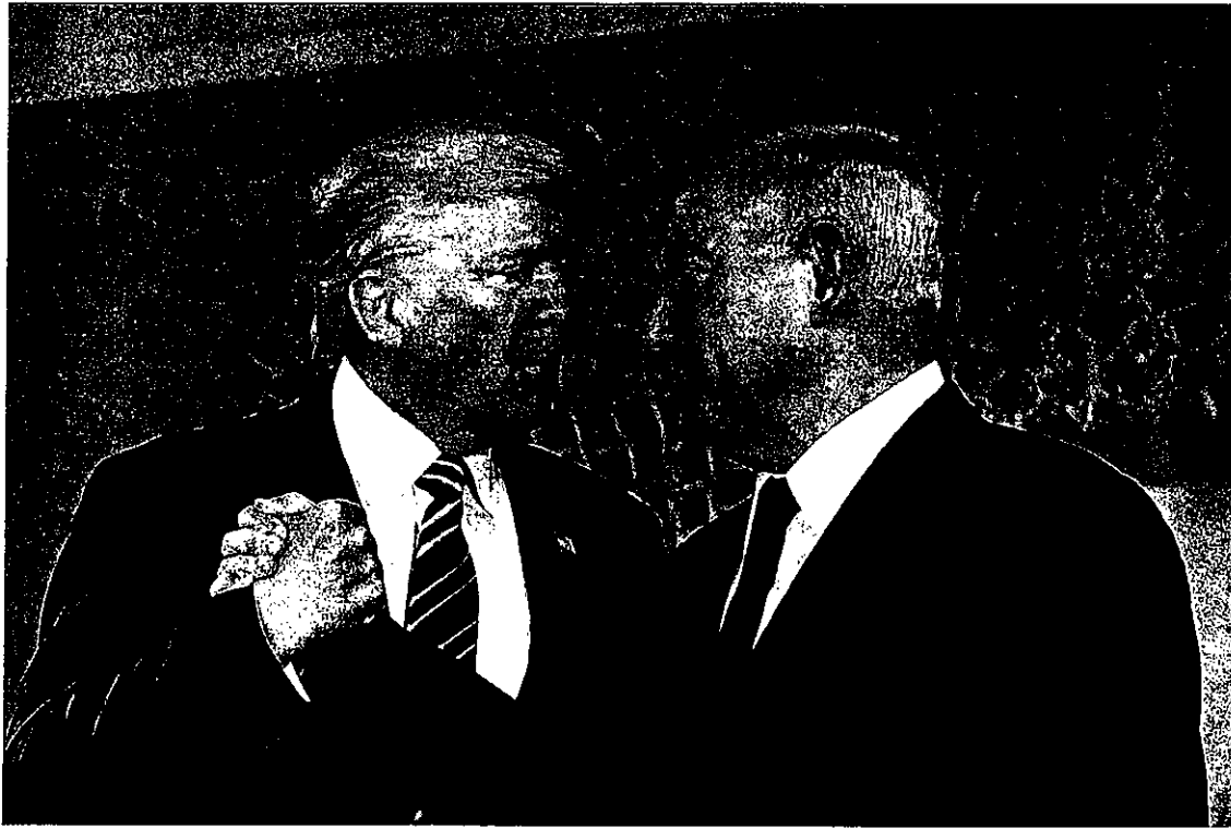
Washington Jewish Week OpEd: "How Donald Trump Became A Freier By Meddling In Israeli Democracy"