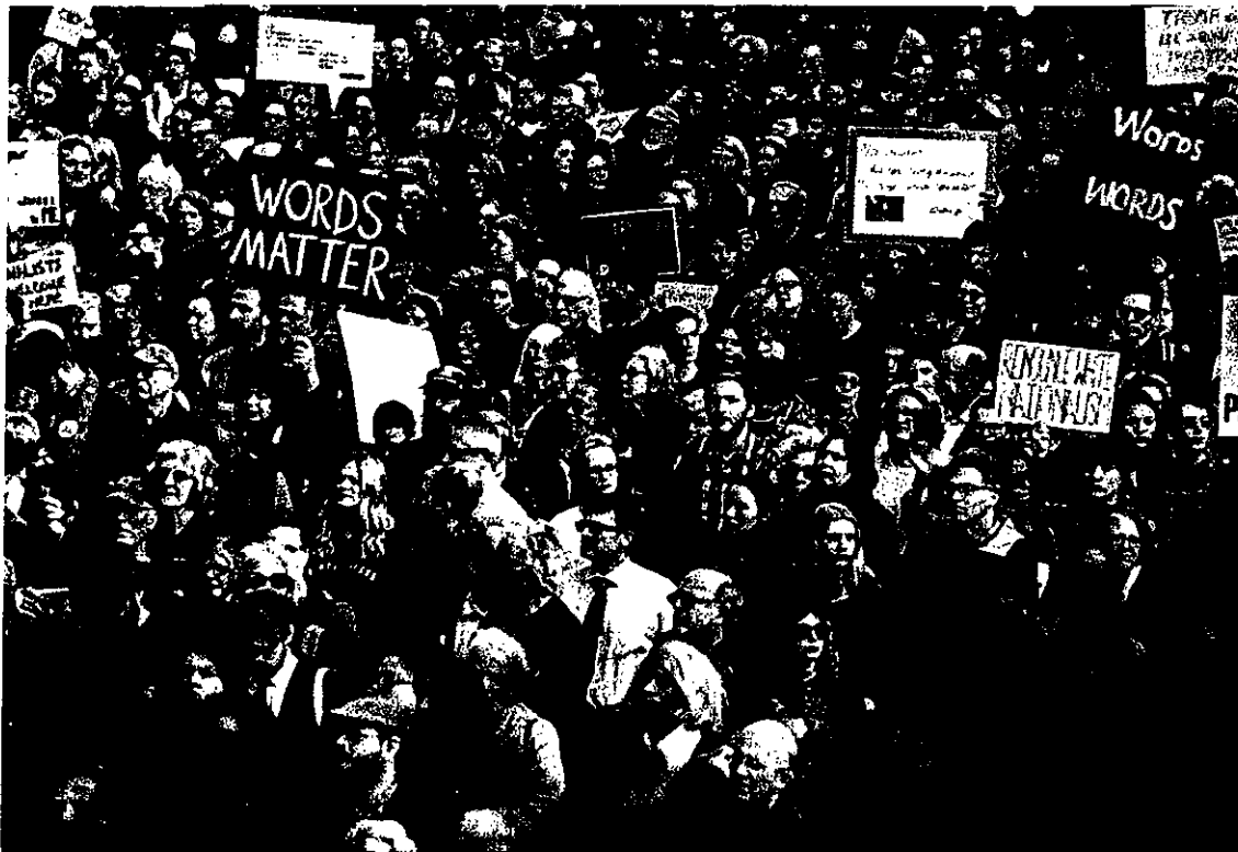
Talking Points Memo OpEd: "Polls Show Israel Advocacy Is Divorced From What Most American Jews Want"