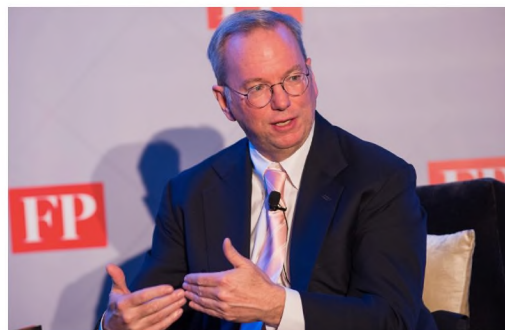
Google Executive Chairman Eric Schmidt