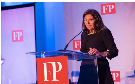
Mayor of Paris Anne Hidalgo