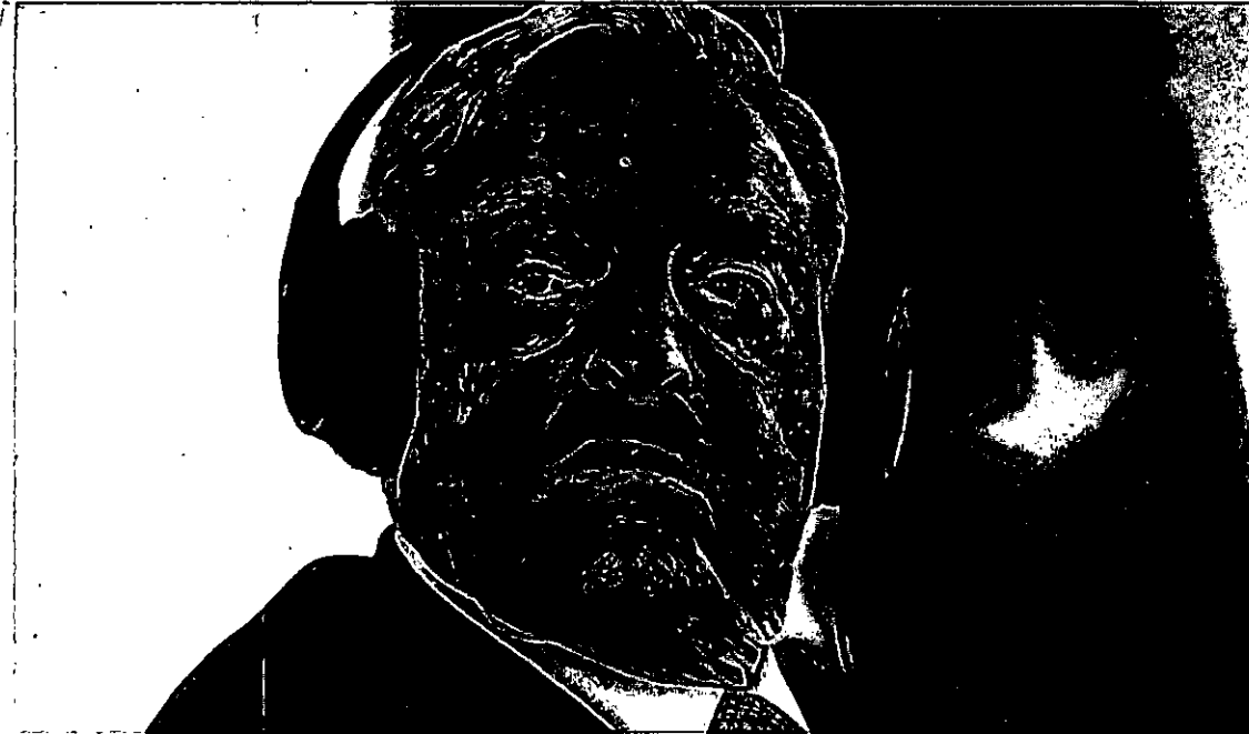
FILE - In this June 8, 2017 file photo Hungarian-American investor George Soros attends a press conference prior to the launch event for the European Roma Institute for Arts and Culture at the Foreign Ministry in Berlin, Germany. Soros said ... more >

By THE WASHINGTON TIMES -- Tuesday, December 12, 2017