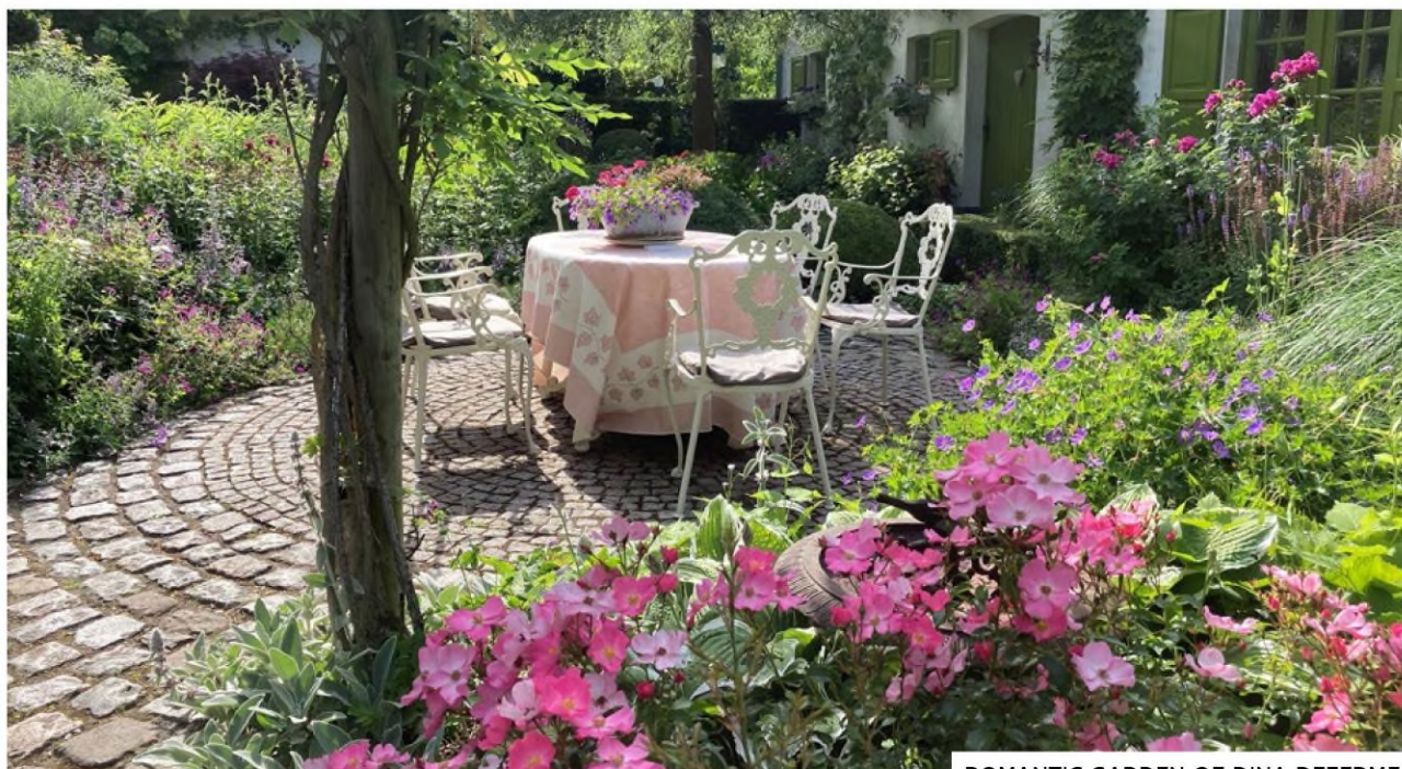
ROMANTIC GARDEN OF DINA DEFERME