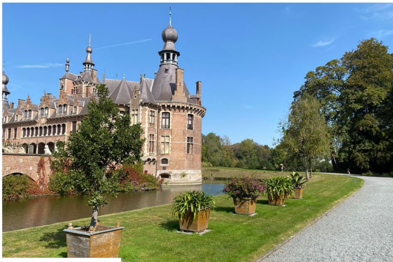
GARDENS OF THE OOIDONK CASTLE