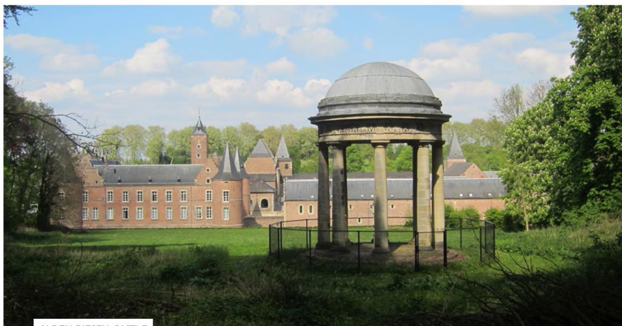
ALDEN BIESEN CASTLE