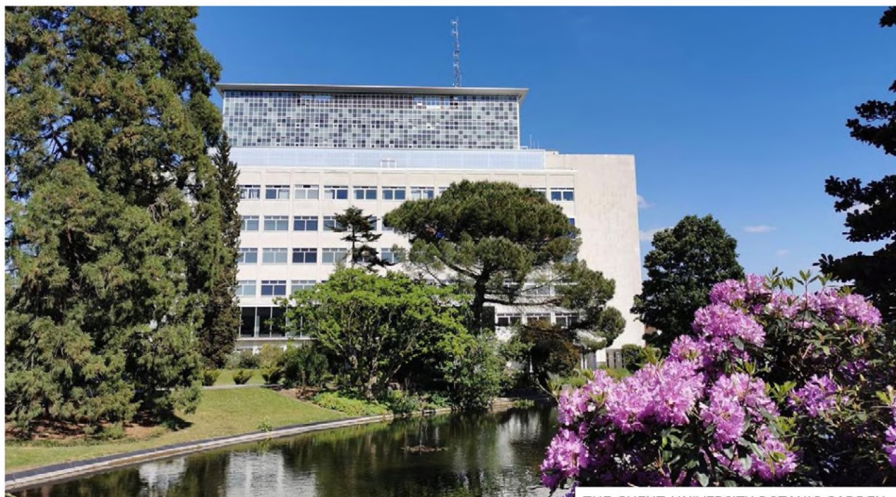
THE GHEENT UNIVERSITY BOTANIC GARDEN