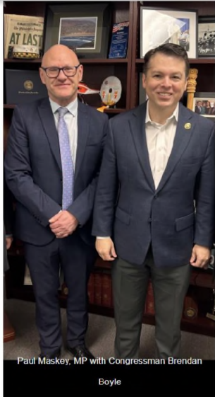
Paul Maskey, MP with Congressman Brendan Boyle