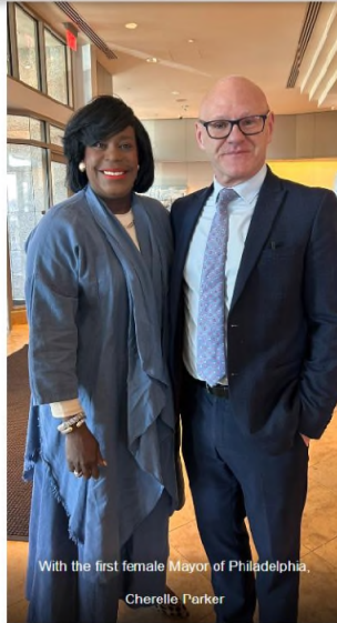
With the first female Mayor of Philadelphia, Cherelle Parker