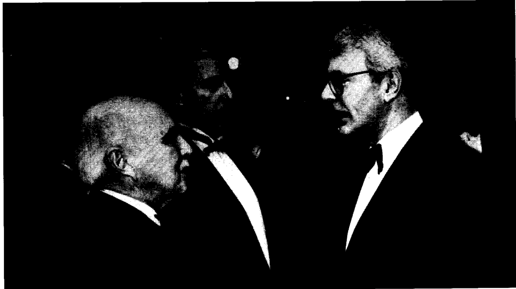
Prime Minister Major Lends Full Support To Building Strong Ties With U.S. Business and Political Leaders

British Prime Minister John Major (right) joined the recent International Investment Forum, delivering the event's keynote address, and lending his