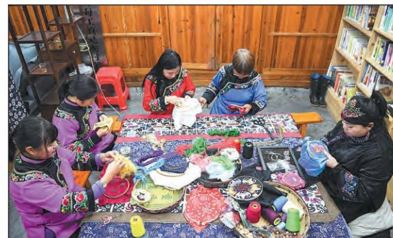
Craftswomen weave traditional brocade in Xiushan Tujia autonomous county, Chongqing, on Jan 23.

According to statistics, there are more than 80 million disabled people in China, including 17 million who are visually impaired.