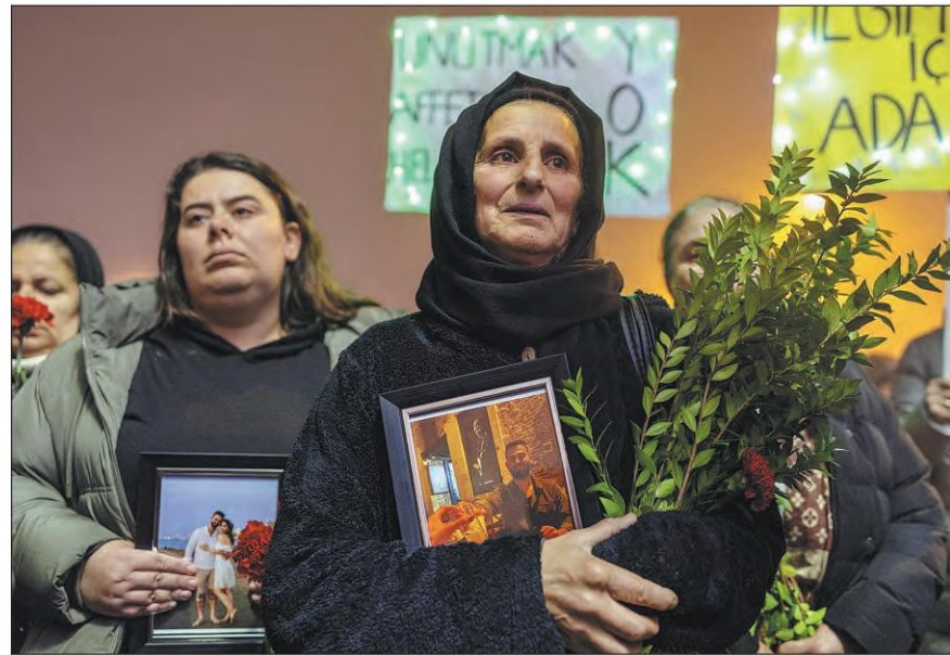
People gather in Hatay, Türkiye, on Tuesday to commemorate the one-year anniversary of the devastating earthquake and remember their lost family members and friends.

The survivors embraced, placing candles where their loved ones were crushed to death in their sleep.