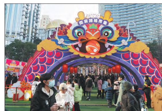
People flock to a Chinese New Year-themed market on East Nanjing Road in Shanghai in January.

"While the city is doing an urban upgrade, new content can revive the old spaces to create Shanghai-style tourism complexes with the city's own cultural symbol," she said.