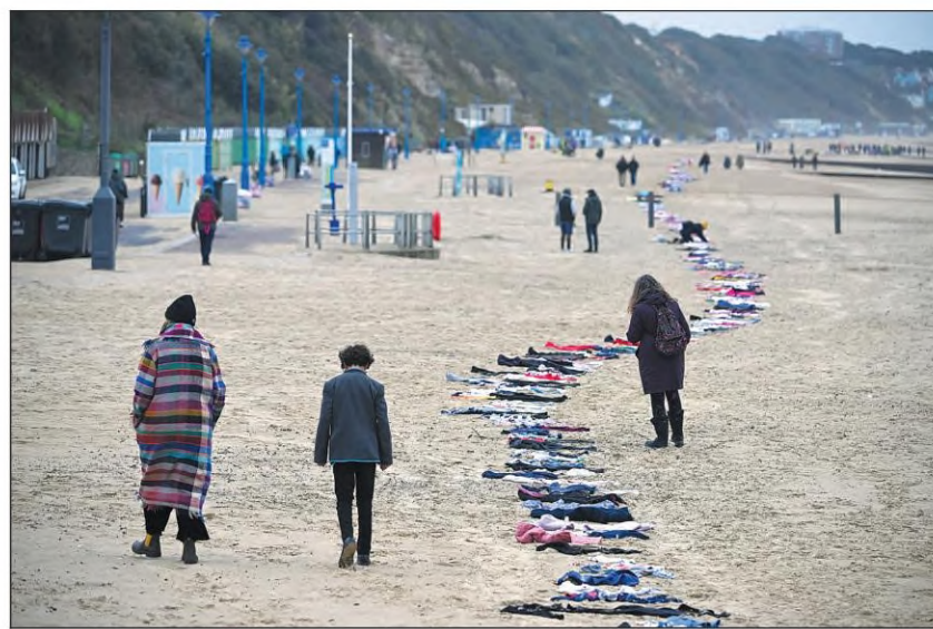
Clothes representing the 11,500 Palestinian children and 36 Israeli children killed in Gaza are on display at the beach in Bournemouth, England, on Monday.