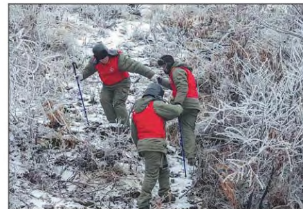
State Grid Wuhan employees do maintenance work in Hubei province.

Contact the writers at zoushuo@chinadaily.com.cn