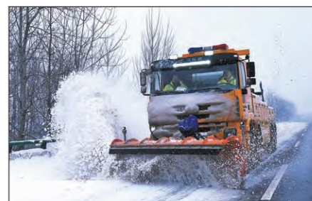
From left: Vehicles are stuck in a traffic jam on the Beijing-Hong Kong-Macao Expressway on Monday. A screen at Wuchang Railway Station in Wuhan displays train delays on Monday. Workers deliver instant noodles and hot water to drivers trapped on a highway in Wuhan. A tractor is used to clear ice and snow along a highway in Anhui.