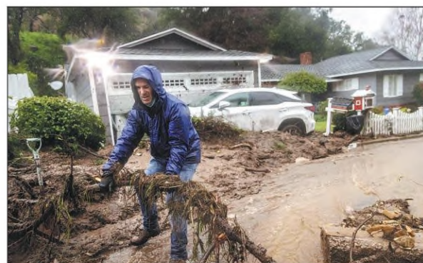
A resident clears debris from a mudslide at a home during a rainstorm in Los Angeles on Monday.