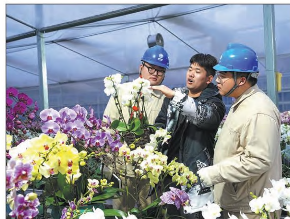
A cultivator of butterfly orchids (center) addresses queries from local State Grid employees in Suqian, Jiangsu province, on Jan 18.

In Sucheng, the cultivation of butterfly orchids has also led to booming sales of plant seedlings, cultural and creative products, exceeding 300,000 yuan daily, and providing nearly 400 jobs for the surrounding areas, said Guo Panpan from Suqian Power Supply Co of State Grid.