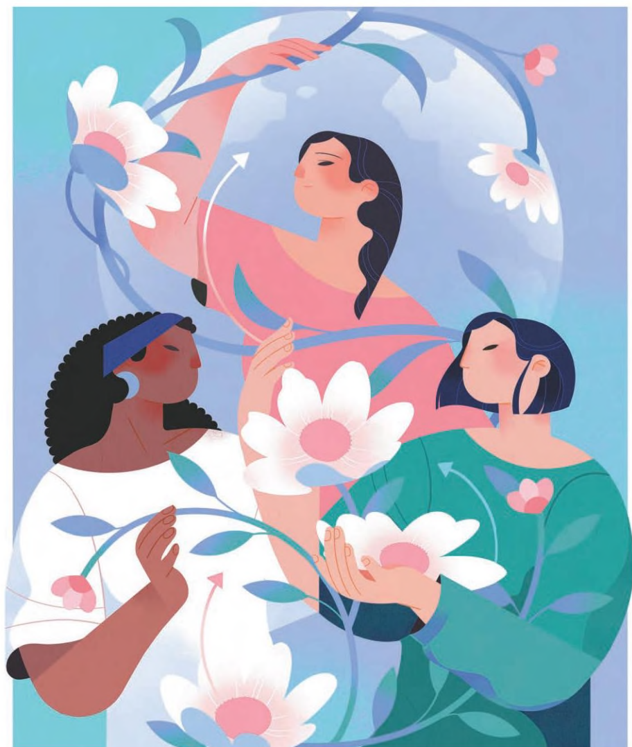
SONG CHEN / CHINA DAILY

The author is a researcher at the Institute of West-Asian and African Studies and the China-Africa Institute at the Chinese Academy of Social Sciences. The author contributed this article to China Watch, a think tank powered by China Daily. The views do not necessarily reflect those of China Daily.