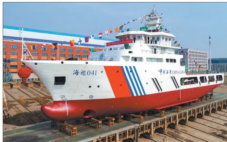
A view of Haixun 041 , an oil spill recovery vessel launched in Wuhan, Hubei province, last week.

The oil recovery system is highly integrated, convenient and fast, and