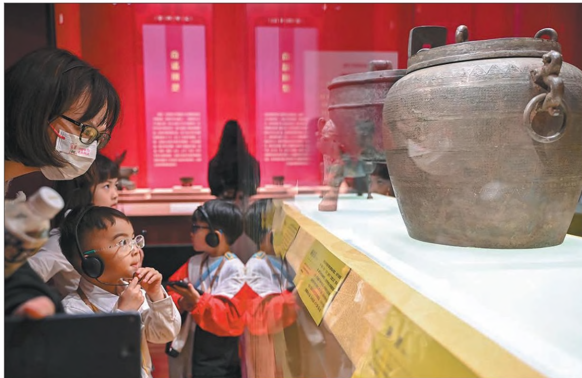
Visitors learn about bronze artifacts at Guangdong Museum in Guangzhou, Guangdong province, on Tuesday. The exhibition focuses on the regional cultures of the upper, middle and lower reaches of the Yangtze River Basin, showcasing 137 precious exhibits from the Shang and Zhou dynasties (c.16th century-256 BC).