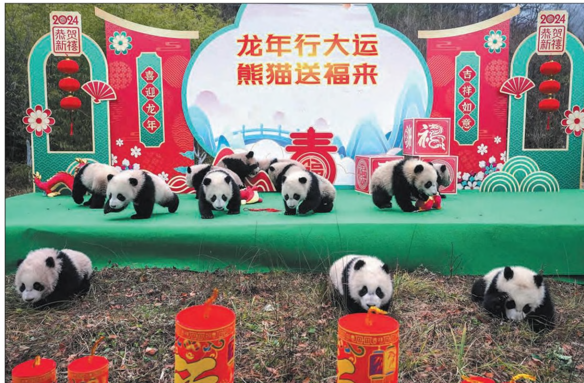
Panda cubs born in 2023 meet the public on Sunday during a celebration to welcome the Year of the Dragon at the Shenshuping base of the China Conservation and Research Center for the Giant Panda in Sichuan province.