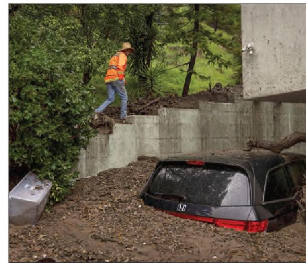
A geologist surveys a mudslide Tuesday caused by heavy rains and runoffs in the Beverly Crest area of Los Angeles.