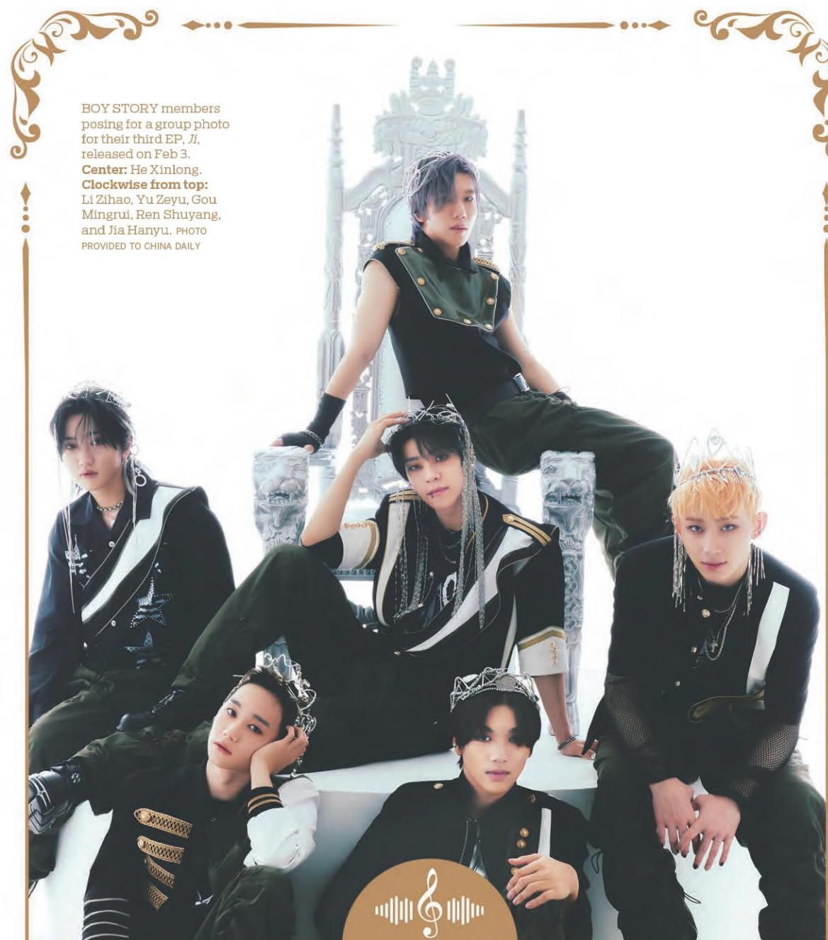
BOY STORY members posing for a group photo for their third EP, Ji , released on Feb 3.

With the COVID-19 pandemic a thing of the past, they were able to hold concerts and perform at music festivals both in China and abroad. Representing China, they also participated in singing the official anthem of COP28, Lasting Legacy , on Dec 2, 2023, in Dubai, United Arab Emirates.