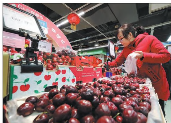
A consumer buys Chilean cherries at a supermarket in Chongqing.

Contact the writers at zhuwenqian@chinadaily.com.cn