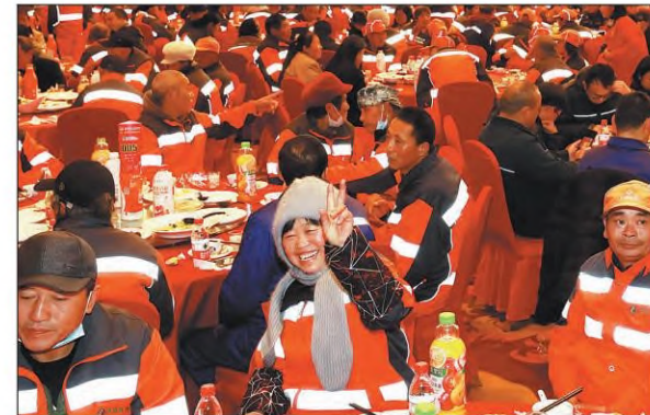
Sanitation workers celebrate the upcoming Chinese New Year at a group dinner in Yiwu, Zhejiang province, on Monday. Over 2,700 sanitation workers who will stay in the city for the holiday attended the event and watched a gala dedicated to them.