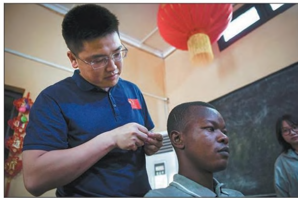
A student receives acupuncture treatment during a lecture at the Confucius Institute of the University of Bangui in the Central African Republic on Monday. The 20th Chinese medical team dispatched to the African nation delivered a lecture on acupuncture and cholera prevention to the university's students.