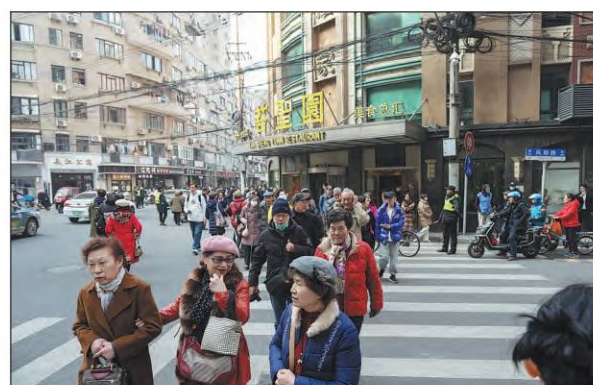
Top: Giant posters of recent hit television series Blossoms Shanghai draw the attention of pedestrians on East Nanjing Road in Shanghai in January.

Data from the Shanghai Municipal Administration of Culture and Tourism showed that the city received nearly 9 million inbound tourists in 2019, earning $8.38 billion in foreign exchange from tourism, which accounted for about 1.5 percent of the city's GDP, signifi-