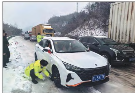
Workers from transportation authorities help vehicles in Anhui province.