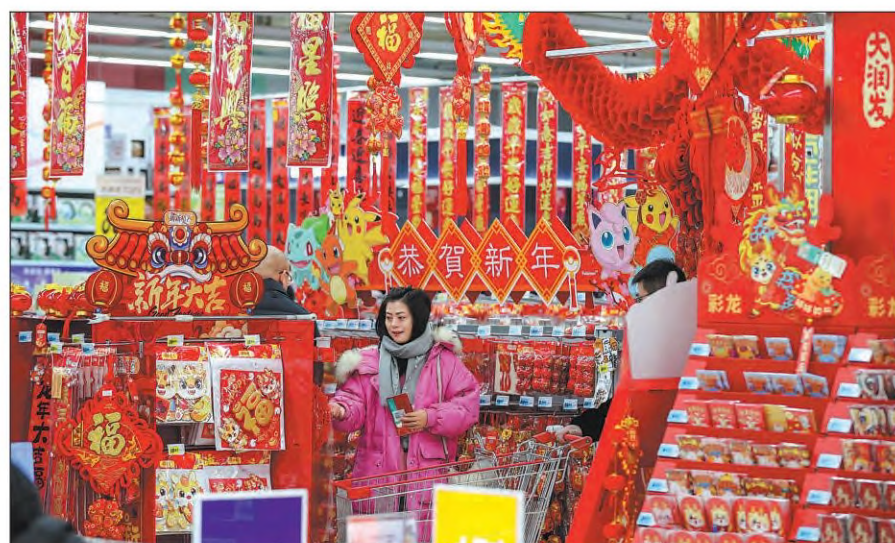
Shoppers browse festive goods at a supermarket in Hua'an, Jiangsu province.

The GAC signed 156 cooperation documents with foreign partners last year, including 84 documents on market access for agricultural and food products with other Belt and Road cooperation partners.