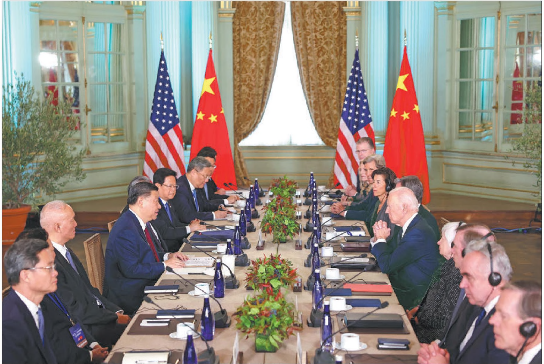
President Xi Jinping holds a summit with US President Joe Biden at the Filoli Estate, a country house approximately 40 kilometers south of San Francisco, California, on Wednesday.