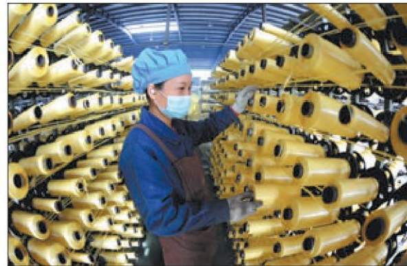
A woman works at a woven bag production line in Lianyungang, Jiangsu province, on Wednesday.

Referring to the recent tone-setting Central Financial Work Conference, Wen said the policy stance will stay accommodative, with focus on creating a favorable monetary and financial environment, expanding central government borrowing while resolving local debt problems, and stabilizing the property market.