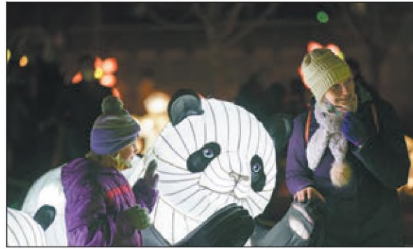
Left: Tourists visit a Spring Festival lantern display at the John F. Kennedy Center for the Performing Arts in Washington last year. Right: A US student learns calligraphy from a Chinese student in New York.