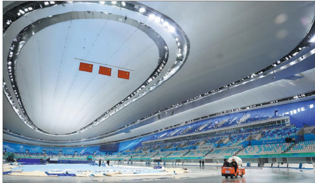
Beijing's Olympic oval, aka the Ice Ribbon, will stage this week's ISU World Cup speed skating meet. NATIONAL SPEED SKATING OVAL

As the second stop of the six-leg ISU World Cup season, the Beijing event has attracted 241 athletes from 25 countries and regions,