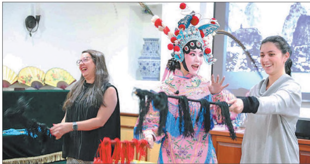
Two people in Washington experience the charm of Peking Opera at a cultural activity organized by the Chinese Embassy in the United States on Oct 15.

Cooperation grows as both sides find more common ground. May Zhou reports in Houston.