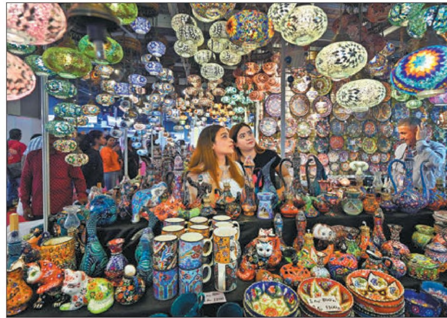
Visitors look at glass lamps in a Turkish stall at the India International Trade Fair in New Delhi on Tuesday. About 3,500 exhibitors from India and 13 other countries, including Iran and Thailand, will showcase their products during the 14-day fair held at the Pragati Maidan.