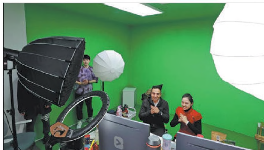
A Pakistani businessman (center) and a colleague ring in the Chinese New Year during livestreaming amid a Silk Road e-commerce New Year's shopping festival on Jan 13 in Shanghai.

The pilot zone is expected to boost the high-quality cooperation development of the Belt and Road Initiative. More efforts will be made to expand opening-up in the e-commerce sector and build a new hub for international