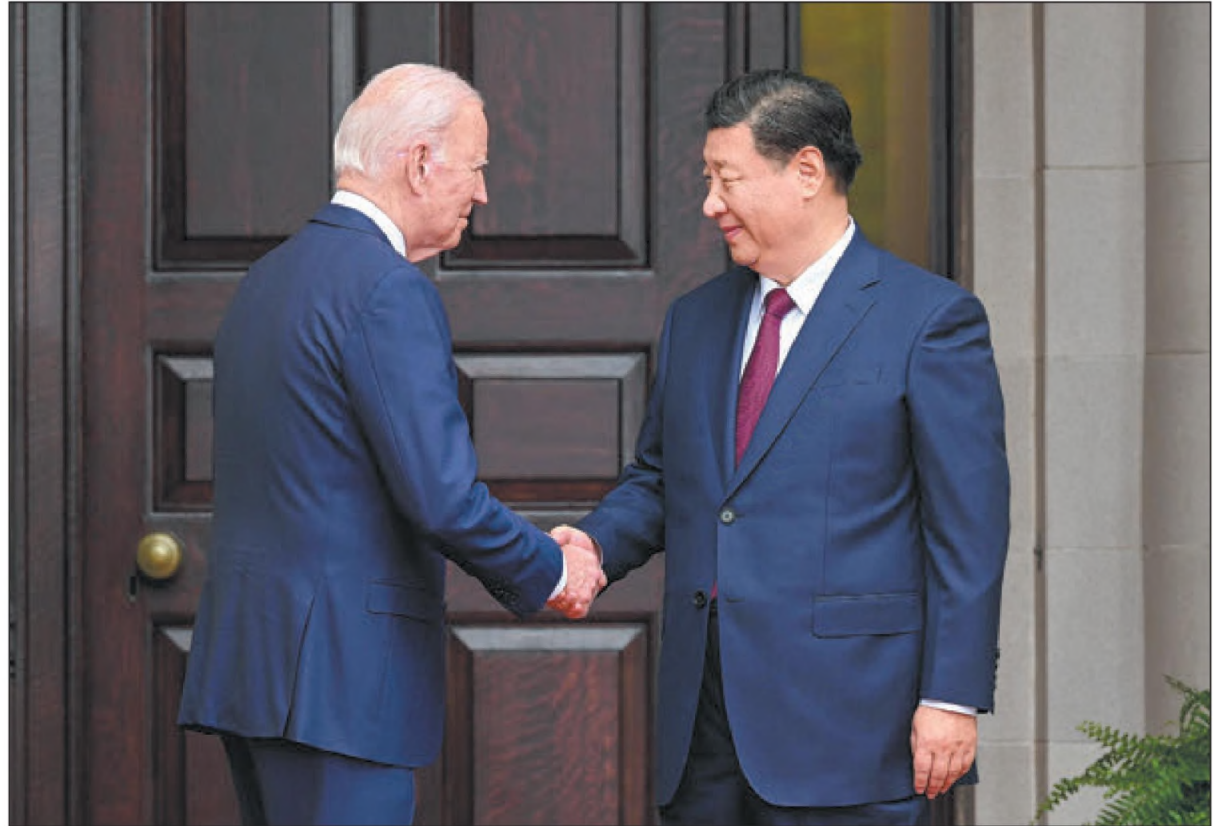
President Xi Jinping shakes hands with US President Joe Biden on Wednesday before their meeting at the Filoli Estate, a country house approximately 40 kilometers south of San Francisco, California.

© 2023 China Daily Global. All Rights Reserved