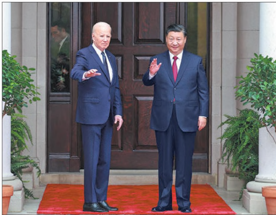
President Xi Jinping and US President Joe Biden wave to the media at the Filoli Estate on Wednesday.