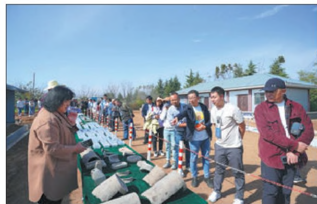
Top: A bird's-eye view of the ruins of Beiting city in Jimsar county, Xinjiang Uygur autonomous region. Above: Participants of the 4th Congress of Chinese Archaeology check artifacts newly unearthed from a tomb accompanying that of Emperor Wen of the Han Dynasty (206 BC-AD 220) in Xi'an, Shaanxi province, on Oct. 25.

created under the influence of the central region. "The groups living on the plateau are believed to have connected with the music bell culture of the central regions in the later stage of the Warring States Period (475-221 BC), and were influenced by that.