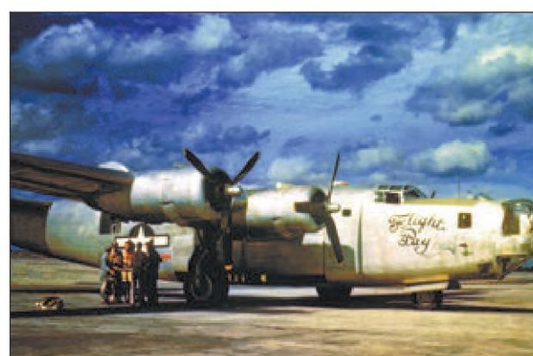
Clockwise from top left: Two US soldiers and a Chinese man pose for a photo on the Yuantong Hill in Kunming. A woman carries a bouquet at the flower market in Kunming. People walk to a fair on the outskirts of Kunming. A US airfreighter lands at the Kunming airport.