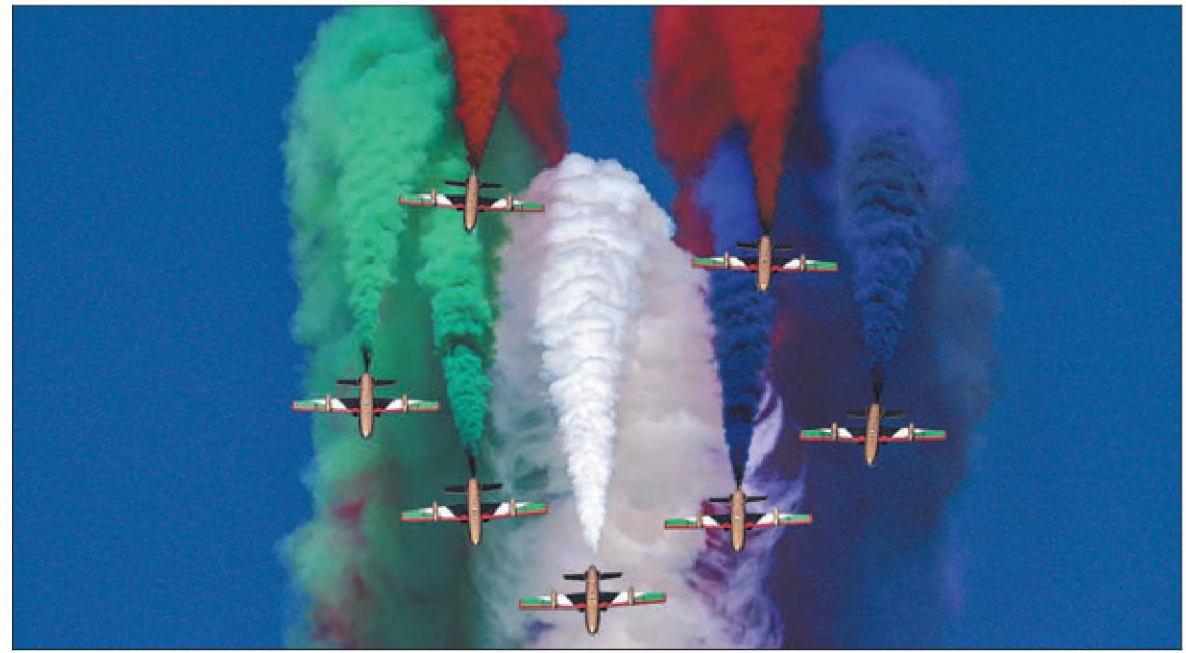
Fursan al-Emerat or the Knights of the UAE, the aerobatics team of the UAE Air Force, puts on an impressive display on Tuesday during the 2023 Dubai Airshow at Al Maktoum International Airport in Dubai in the United Arab Emirates.