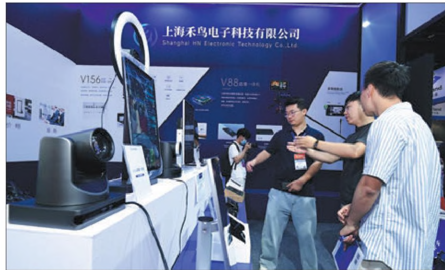
Visitors check out livestreaming devices displaying artificial intelligence-powered digital anchors during an e-commerce expo in Yiwu, Zhejiang province, in June.