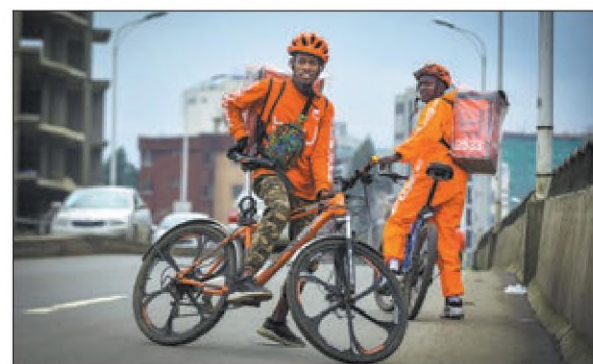
Employees of BeU Delivery, a Chinese-invested company, prepare to deliver meals in Addis Ababa, Ethiopia.

"The majority of Chinese businesses in Africa focus on helping the continent cultivate endogenous growth capacity and actively promote the process of poverty reduction and development in Africa," said the report, published in Nairobi