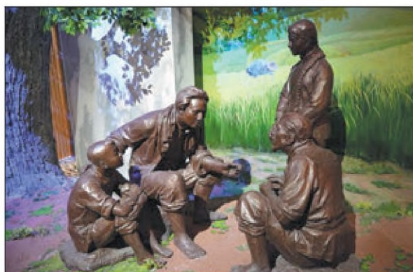
Clockwise from top: "No investigation, no right to speak," Mao Zedong's famous maxim is immortalized in the yard of the Xunwu Research Memorial Hall. Mao's desk in Xunwu, where he wrote "Report from Xunwu" and "The Opposition to Dogmatic Idealism." A sculpture in the memorial hall features Mao conducting investigative studies with farmers in Jiangxi.