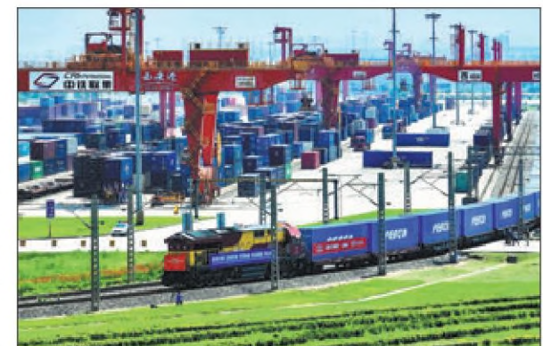
The freight train carrying the first batch of solar modules for China Energy Engineering Corp's 1-gigawatt projects in Uzbekistan, departs from Xi'an, Shaanxi province, on Aug 3.