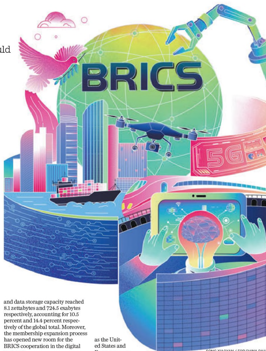
SONG XIAOYAN / FOR CHINA DAILY

The five BRICS members have fast-growing digital economies and huge market potential, providing ample room for further cooperation in the digital economy. The BRICS members collectively account for a considerable share of global GDP and the world's population. Together, the BRICS countries comprise more than 40 percent of the world's internet users and have abundant digital resources. In 2022 alone, China's data output