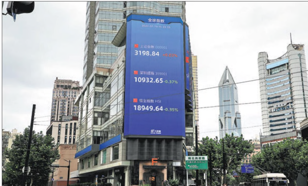
A street screen in Shanghai shows the Shanghai Composite Index, Shenzhen Component Index and Hong Kong's Hang Seng Index of the day on July 19.