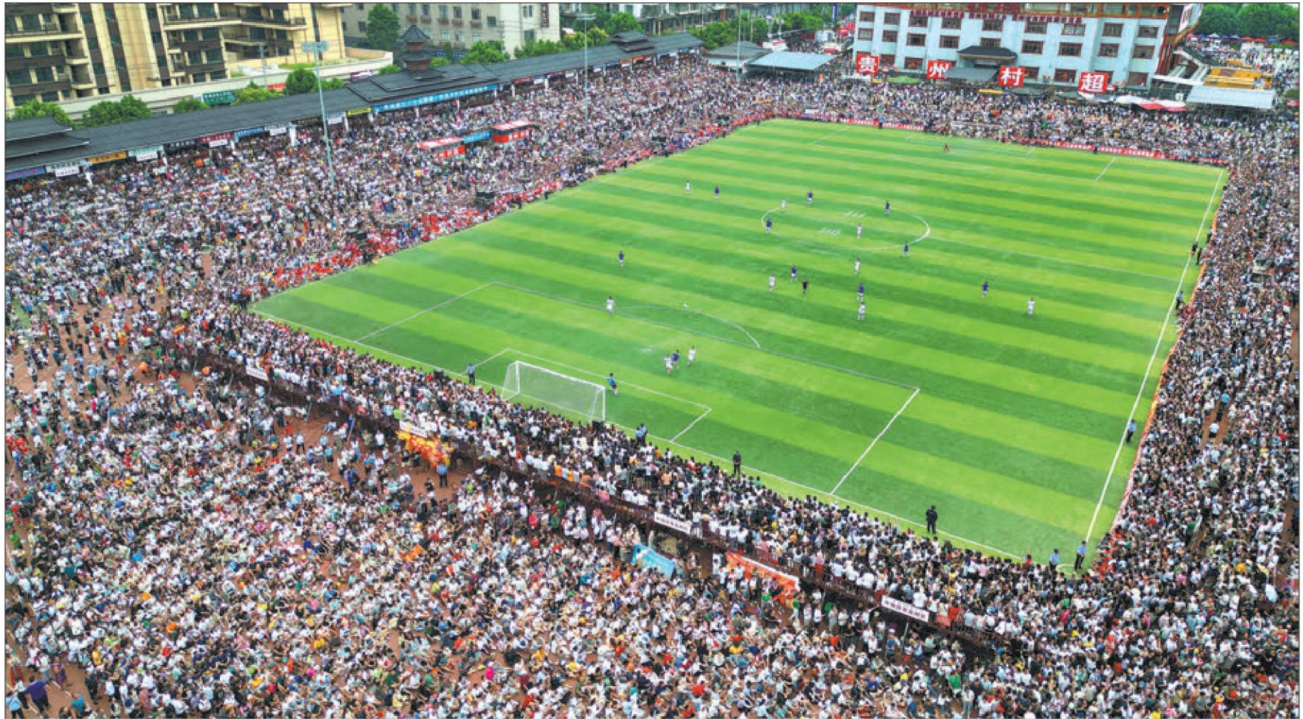
Spectators surround the field during an elimination game on the final day of the "Village Super (Soccer) League" in Rongjiang county, Guizhou province, on July 29.