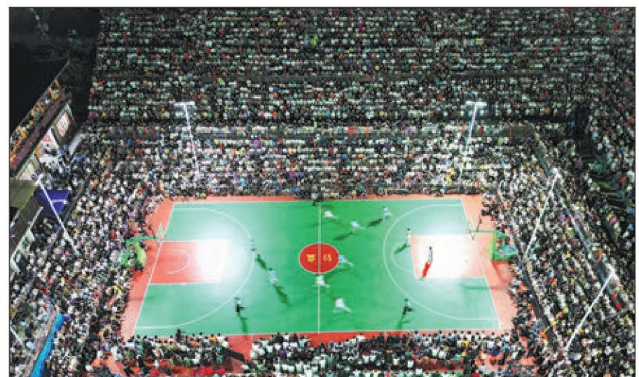
From left: An aerial photo shows villagers playing a beach volleyball game in Lantian village, Wenchang, Hainan on July 20. Spectators pack a stadium to watch the final of the "Village Basketball Association" staged in Taipan village, Taijiang, on July 30.