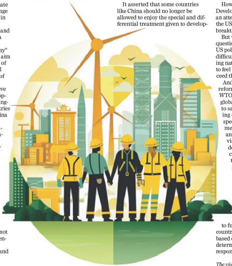
MA XUEJING / CHINA DAILY

The views do not necessarily reflect those of China Daily.