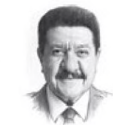
The author is chairman of Turkish-Chinese Business Development and Friendship Association.

As a developing nation, China is aware of the obstacles to progress and the unjust treatment other develop-