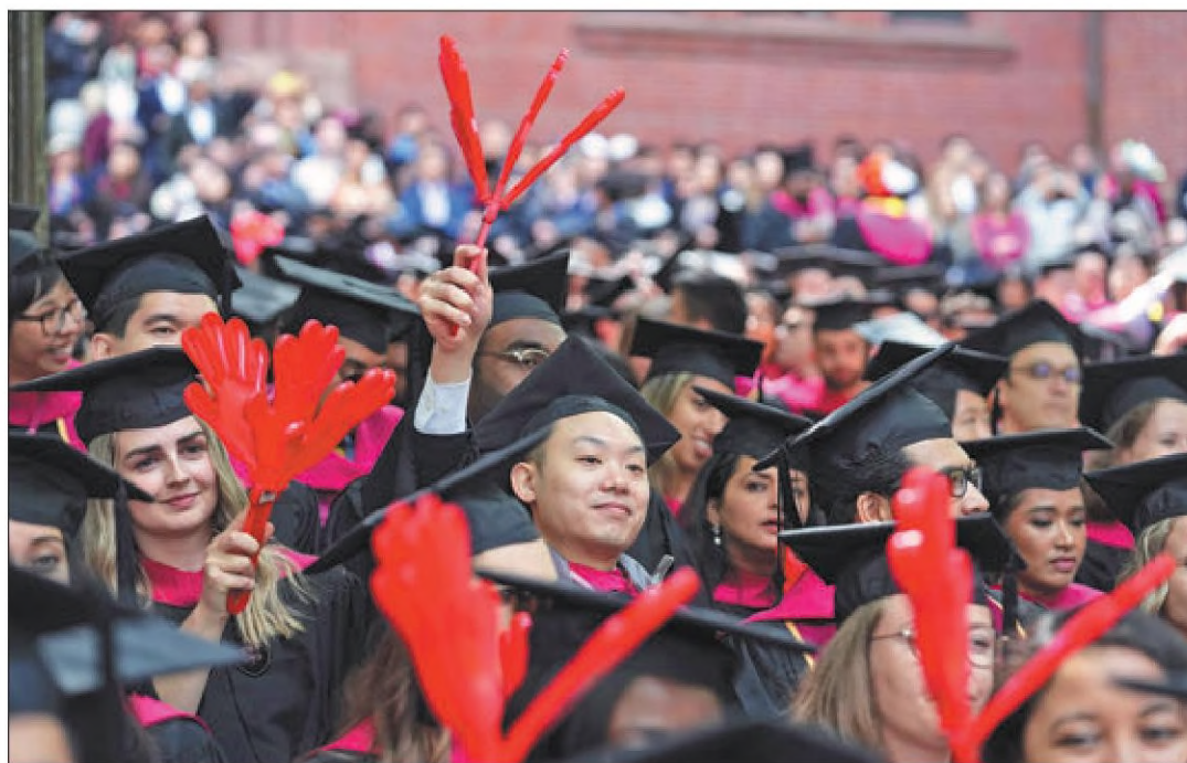
Top: Students stroll on the campus at Cornell University in Ithaca, New York, after graduating in May. Above: Harvard University students celebrate their graduate degrees in public health during commencement ceremonies in Cambridge, United States, in May.

"I am willing to step out of my comfort zone, as remaining there without ambition or motivation is too boring."