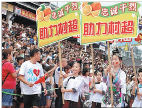
Children wearing traditional costumes of ethnic groups cheer during a "Village Super" game on July 28.