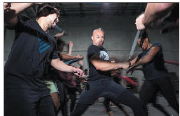
Students attend a stunts training session at the Tempest Academy in Chatsworth, California, on Thursday.