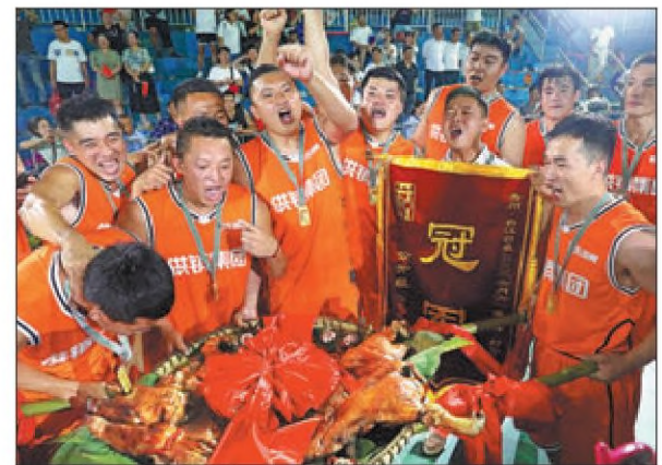
Members of the team that won the "Village Basketball Association" championship pose with their prize, a roasted piglet, in Taipan village, Taijiang county, Guizhou, on July 31.