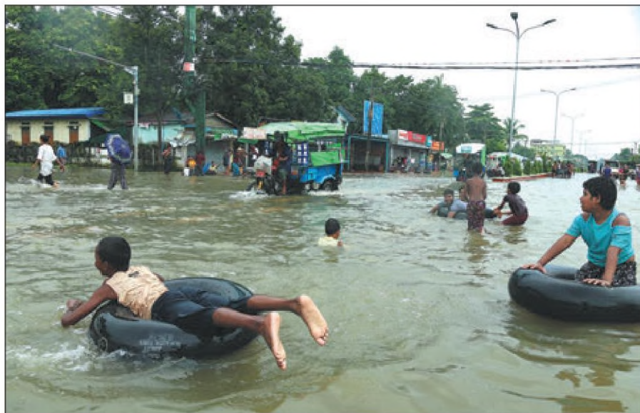
Children float on rubber tires in stagnating water in Bago Region, Myanmar, on Saturday. Floods and landslides caused by monsoon rain have killed five people and forced more than 48,000 people to flee their homes, authorities said.