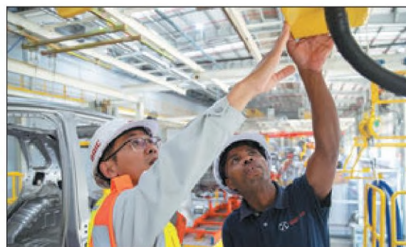
A South African employee works with his Chinese colleague at an automobile factory in Eastern Cape on May 9.

Wang Wentao, China's minister of commerce, met South African