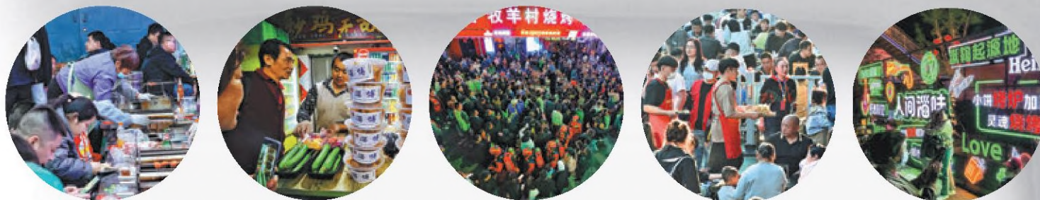
From left: Visitors enjoy barbecued food, pancakes and beer in Zibo, Shandong province.