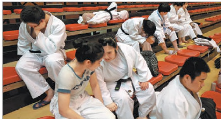
A total of 135 athletes participated in the National Para Judo Championships in Beijing last week. Hunan province topped the medal table with five golds.

transformational — making her more persistent and resilient, both on and off the mat.