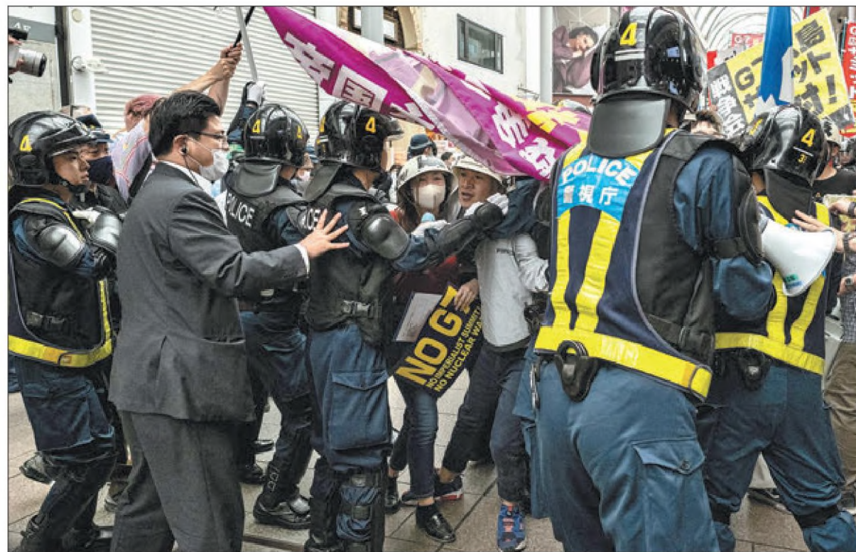
Japanese police clash with anti-G7 protesters in Hiroshima, Japan, on Sunday as leaders of the G7 countries met for a summit.

GLOBAL EDITION 中國日報 MONDAY, MAY 22, 2023