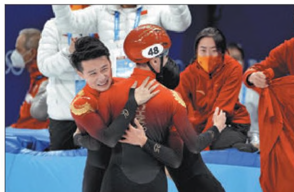
Beijing 2022, the official film of last year's Winter Olympic Games, revisits some of the cherished moments of top athletes like snowboarder Su Yiming (left), Japanese figure skater Yuzuru Hanyu (center), speed skaters Ren Ziwei and Wu Dajing (right).

During the Beijing Winter Olympics last year, Japanese figure skater Yuzuru Hanyu held a news conference a few days after missing the podium for the men's singles free skate competition, taking fourth place.