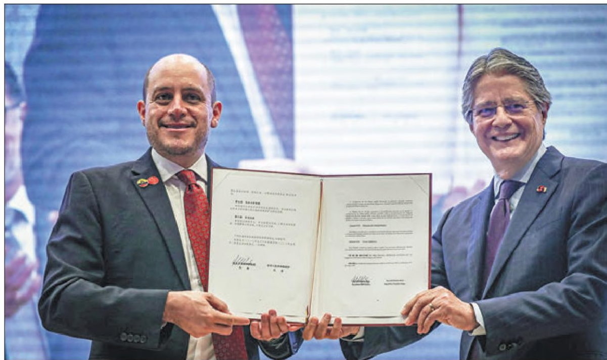
Ecuadorian President Guillermo Lasso (right) and Minister for Production, Foreign Trade, Investment and Fisheries Julio Prado display documents of the free trade agreement between China and Ecuador in Quito, Ecuador, on May 10.

business leaders hailed the agreement as a boon for growth.