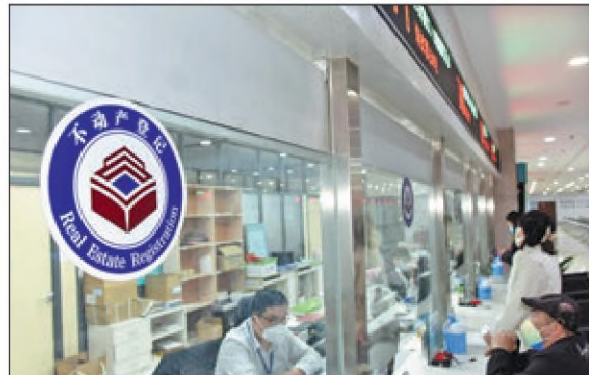
Citizens (right) apply for real estate property ownership certificates at a real estate registration center in Qingdao, Shandong province, on Feb 23.

"It should only be collected during an upward and vibrant property market when the broad economy