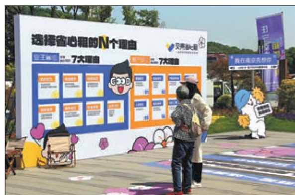
Top: A real estate project is under construction in Fuzhou, Fujian province, on April 1. Above: Visitors read information on a rental housing project of Beike, an integrated online and offline platform for housing transactions and services, during Jinling STYLE living festival in Nanjing, Jiangsu province, on April 30.

recovered and stabilized in terms of a number of key indicators. Ahead, however, there is still further policy