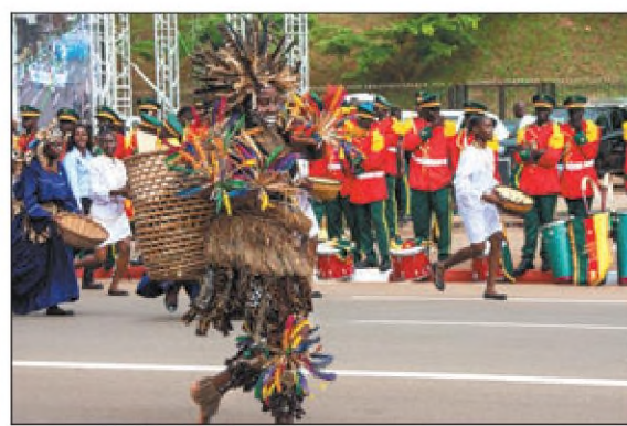
Dancers perform on Saturday during National Day celebrations in Yaounde, Cameroon. The country marked the 51st anniversary of its National Day with military and civilian parades in the capital city, and festivities elsewhere.