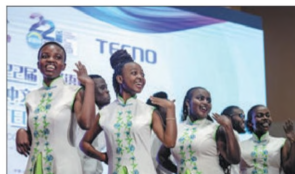
Contestants perform in the final stage of the 22nd Chinese Bridge-Chinese language proficiency contest for foreign college students at the University of Nairobi, in Kenya, on May 12.

ization meets African renaissance at the Forum on China-Africa Cooperation and BRI."