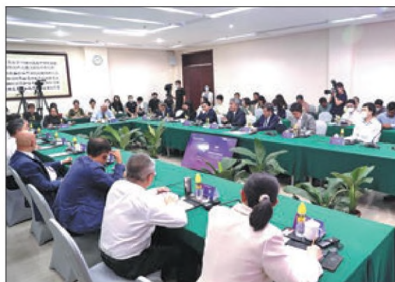
Experts talk about building the world's largest free trade area during a parallel session of the RCEP Media & Think Tank Forum in Haikou, Hainan province, on Sunday.