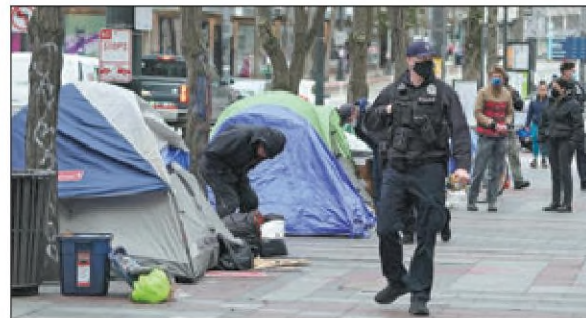
A Seattle police officer walks past tents used by homeless people on March 11, last year.

The Senate is going ahead with a planned one-week recess this week. The Senate Majority Leader, Chuck Schumer, made the announcement