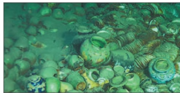
Top: The manned submersible Shenhai Yongshi , or Deep Sea Warrior, is launched on Saturday for the first exploration mission involving two shipwrecks at a depth of about 1,500 meters in the South China Sea. Above: A photo released on Sunday by the National Cultural Heritage Administration shows porcelain scattered around one of the shipwrecks in the South China Sea.

Advanced technological approaches, including soft robotics inspired by bionics and material science, were employed during the operation to salvage some of the relics from the shipwreck sites. New methods of scanning, photography and monitoring were also used.