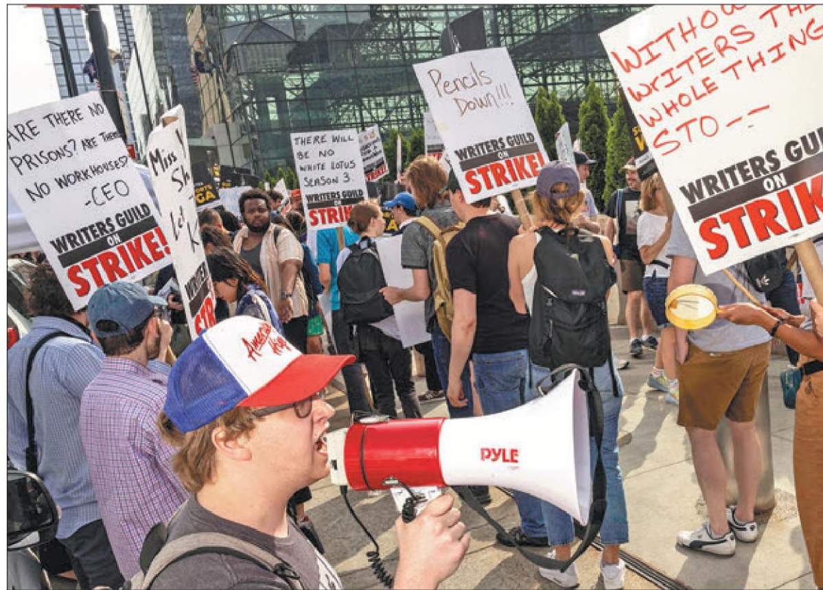
Members and supporters of the Writers Guild of America form a picket line in New York, on Tuesday. The strike kicked off on May 3, with writers demanding better pay.

Biden's negotiators also proposed essentially holding military spending flat for next year. Biden's budget