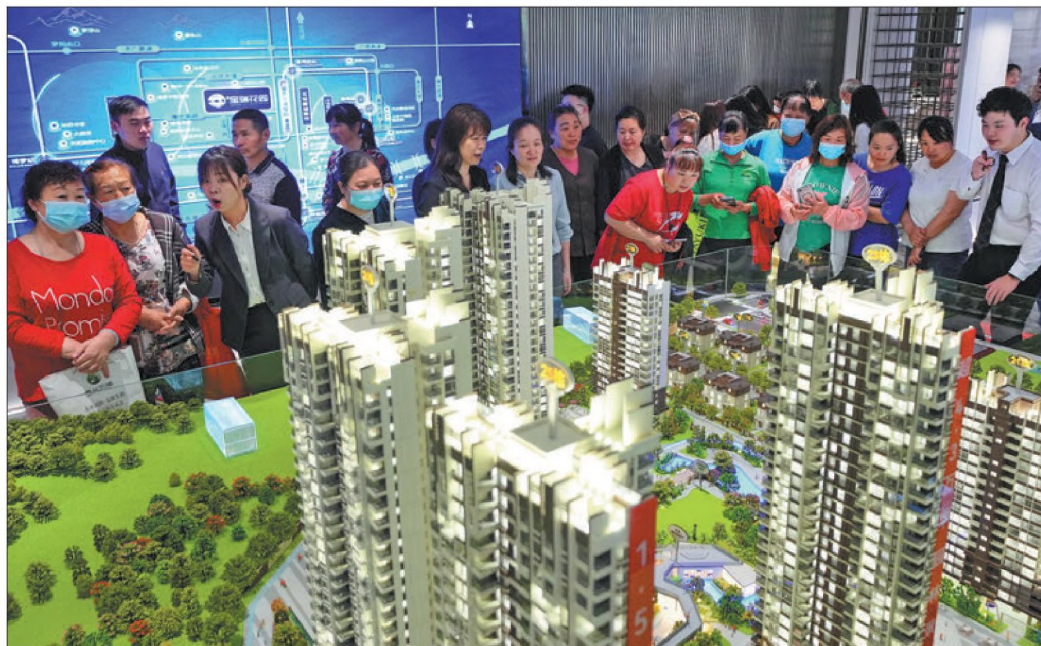
Salespeople introduce a residential property project to prospective homebuyers in Huizhou, Guangdong province, on March 21.