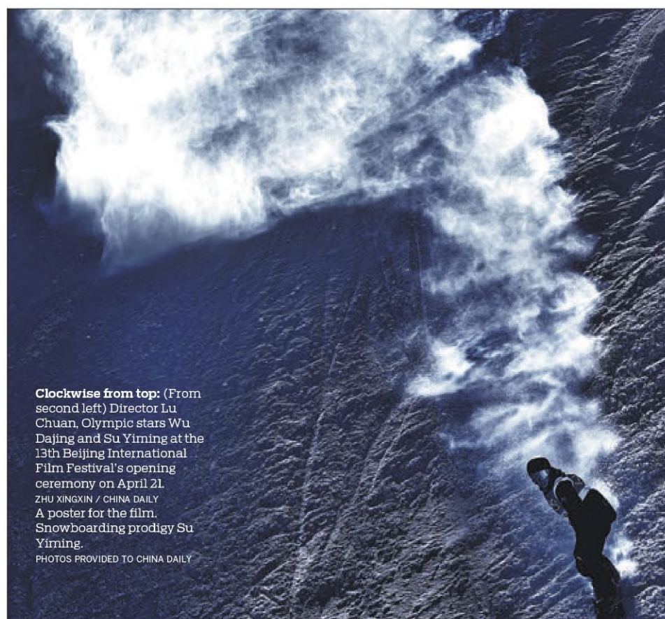
Clockwise from top: (From second left) Director Lu Chuan, Olympic stars Wu Dajing and Su Yiming at the 13th Beijing International Film Festival's opening ceremony on April 21. A poster for the film. Snowboarding prodigy Su Yiming.