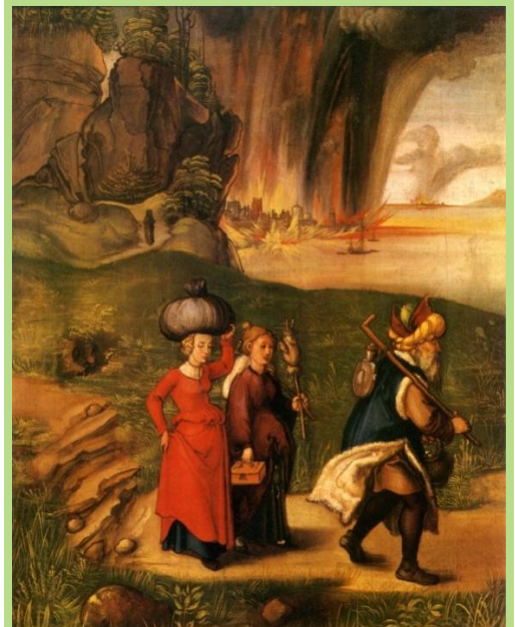
Albrecht Dürer: Lot and his family flee from Sodom

In other words, the key to holiness is falling love!