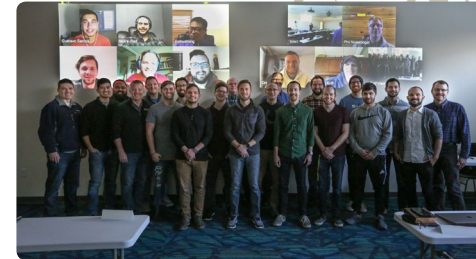
Faith Bible Seminary