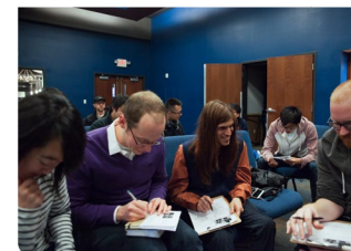
College & International Ministries