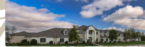
Faith Christian School